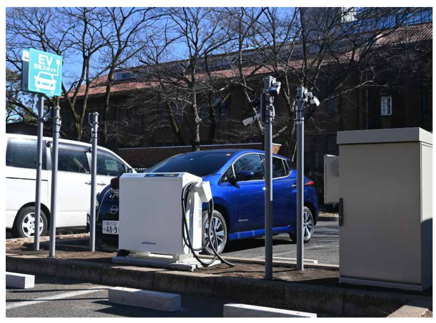
BEV charging spot for research purpose (at Parking Lot of Komaba Research Campus)