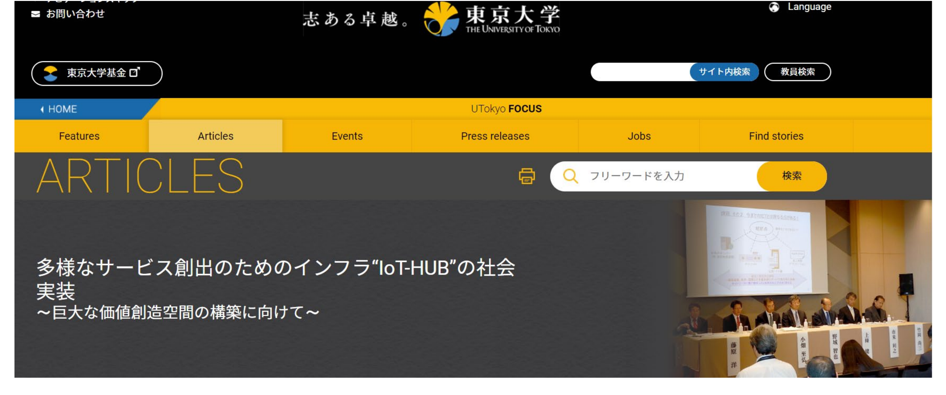
Social Implementation of Infrastructure for Interconnection among any IoT Systems (Press Conference in May 29, 2019) https://www.u-tokyo.ac.jp/focus/ja/articles/z0205_00056.html