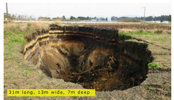
Sinkhole caused by internal erosion in volcanic "Shirasu" layer in Miyakonojo, Miyazaki (Sept. 2016)

By repetition of erosion and failure of cavity ceiling, a cavity moves upward