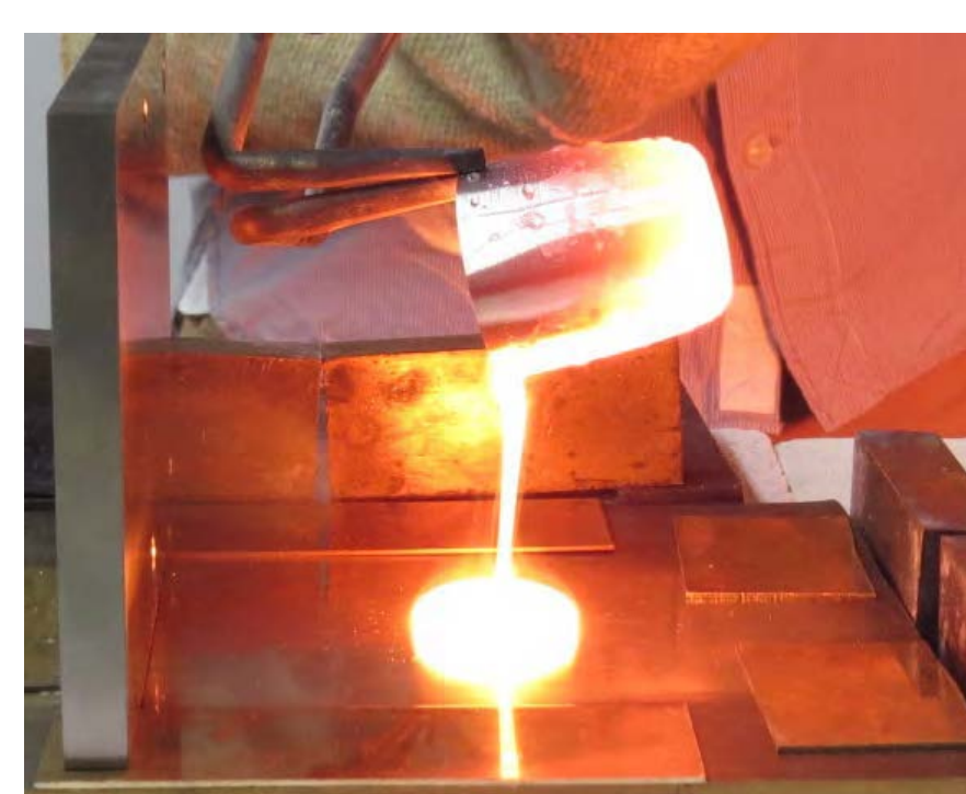
Melting of simulated waste borosilicate glass