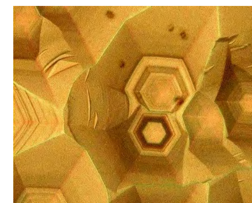
Direct observation of high-temp. interface during crystal growth