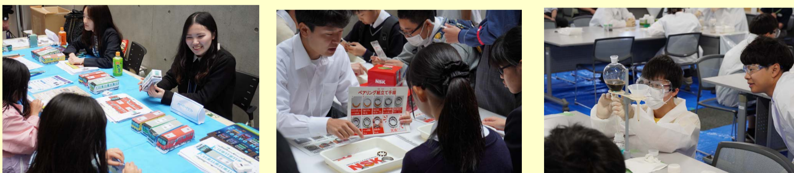
Open House of "KOMABA Research Campus" for Junior High and High School Students