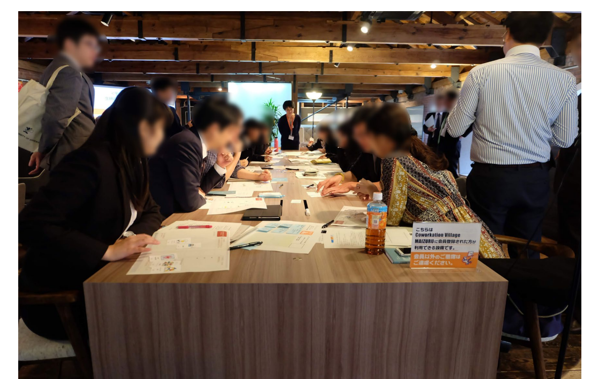
Held a WS for extracting latent issues by tools used in regional cooperation activities at IIS.