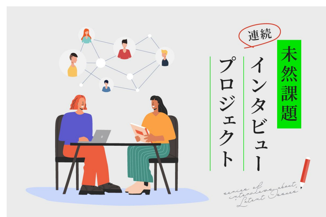
A series of interviews with IIS researchers on the common theme of “latent issues”