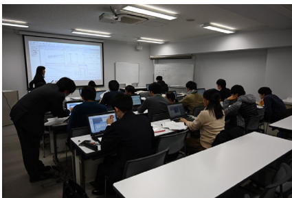
Lecture "Advanced Optical Engineering" at Graduate School of Engineering