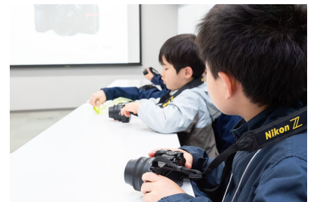
Science School at Komaba Research Campus Open House