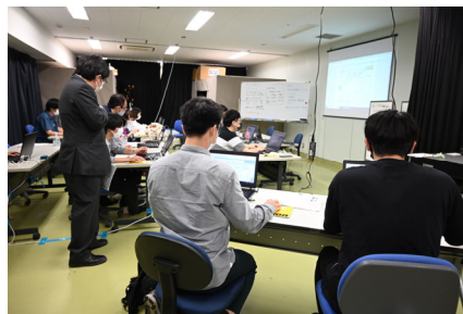
Consortium on Education and Research on Advanced Laser Science (CORAL)