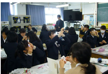
ONG Event "Traveling Lecture" at Saitama Prefectural High School