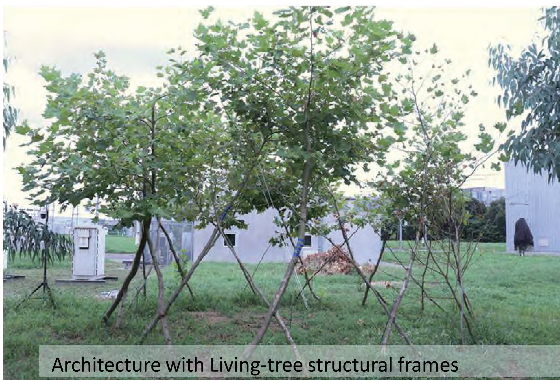
Architecture with Living-tree structural frames

The suspended ceiling always has a risk of falling. In particular, the large-span architecture has large risk due to large area and high position of ceiling and heavy weight of lighting equipment, which injured the users in the buildings in some cases. Last year we conducted the survey on the ceiling damage in Noto-Peninsula EQ 2024 & Bungo-Strait EQ.