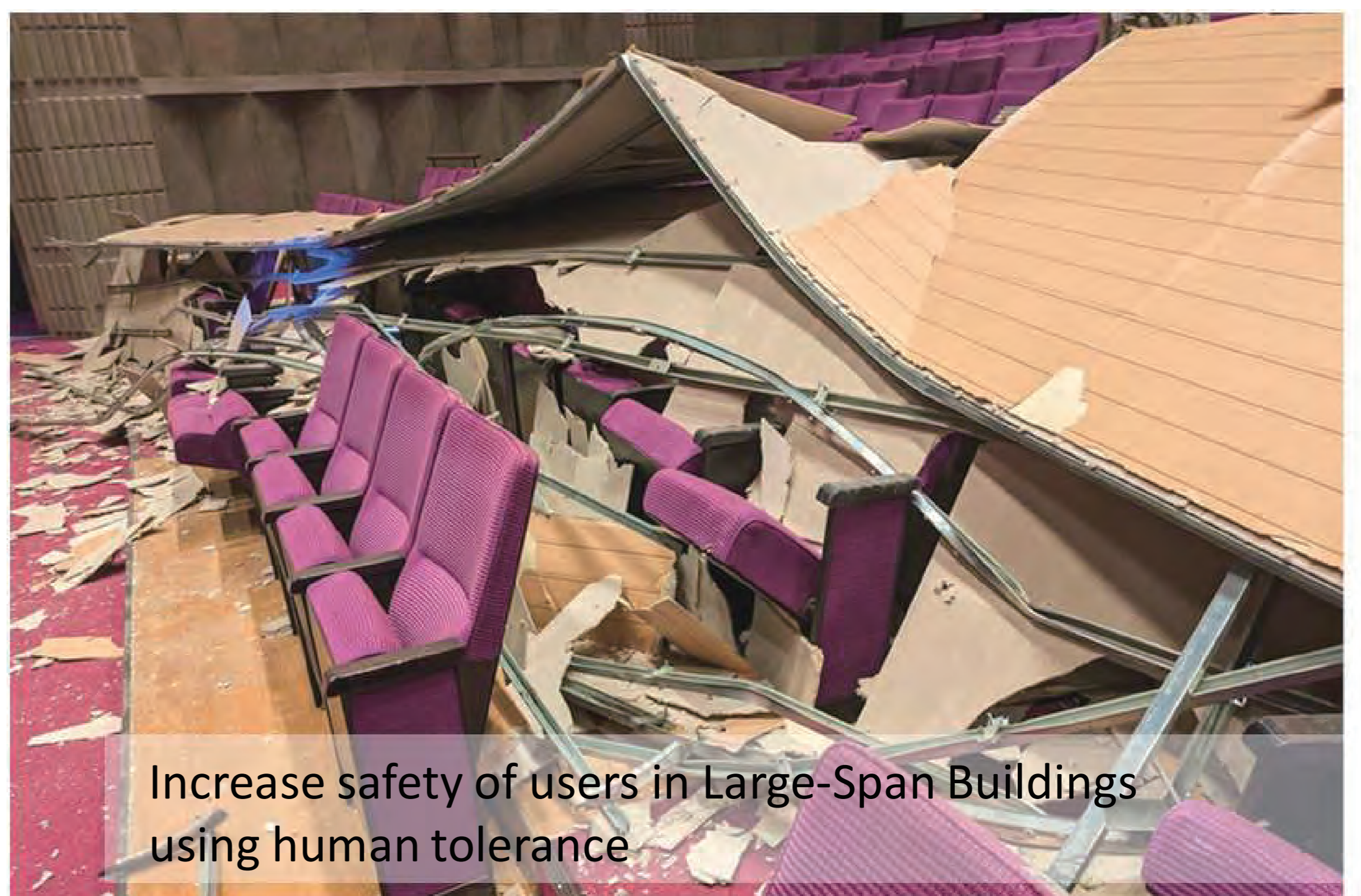
Increase safety of users in Large-Span Buildings using human tolerance

The World 1st typical tensegrity frames was constructed as building skeletons in Chiba in 2001. “White Rhino II” is the successor constructed in Kashiwa Campus in 2017. The pentagonal and tower-type tensegrity supports the membrane roof, and at the same time make us feel the sense of “floating the bars in the air”. (Collaboration with Imai lab. in IIS)