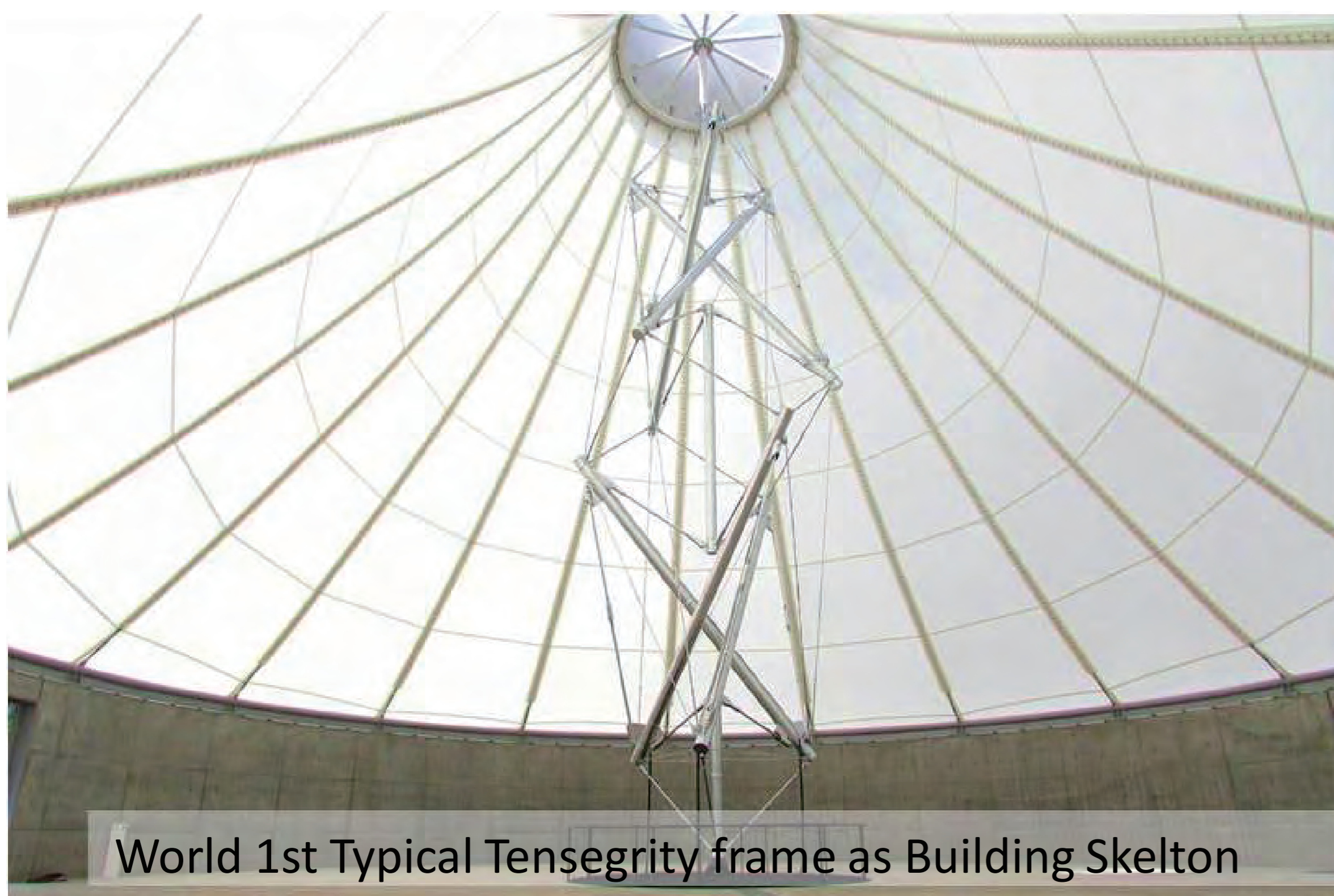
World 1st Typical Tensegrity frame as Building Skelton

Kawaguchi- MutoLab. performs research and development of various 3-dimensional spatial structures ,which have advantageous features to conventional planar frame structures. Spatial structural systems are usually highly efficient with light-weight and high rigidity. We are tackling a wide range of research topics on the theme of “spatial structure” including the investigation of damage on the ceilings in large-space architecture and huge expandable reflector in space.