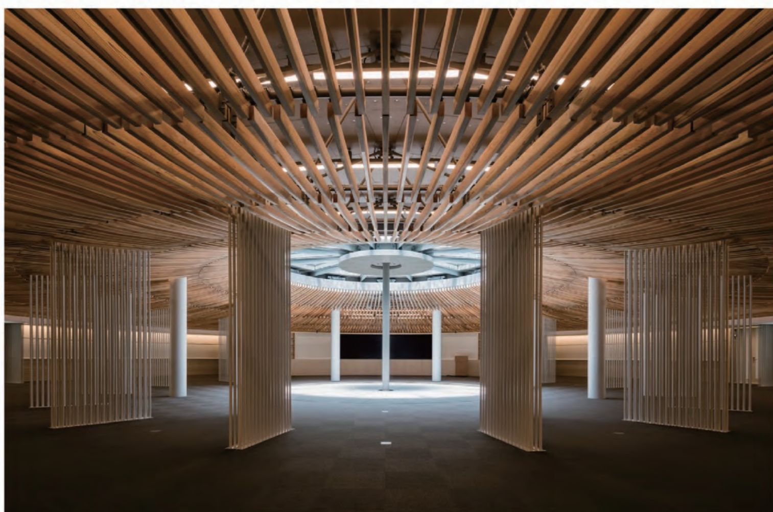
The Grand Library of the University of Tokyo, Tokyo, Japan