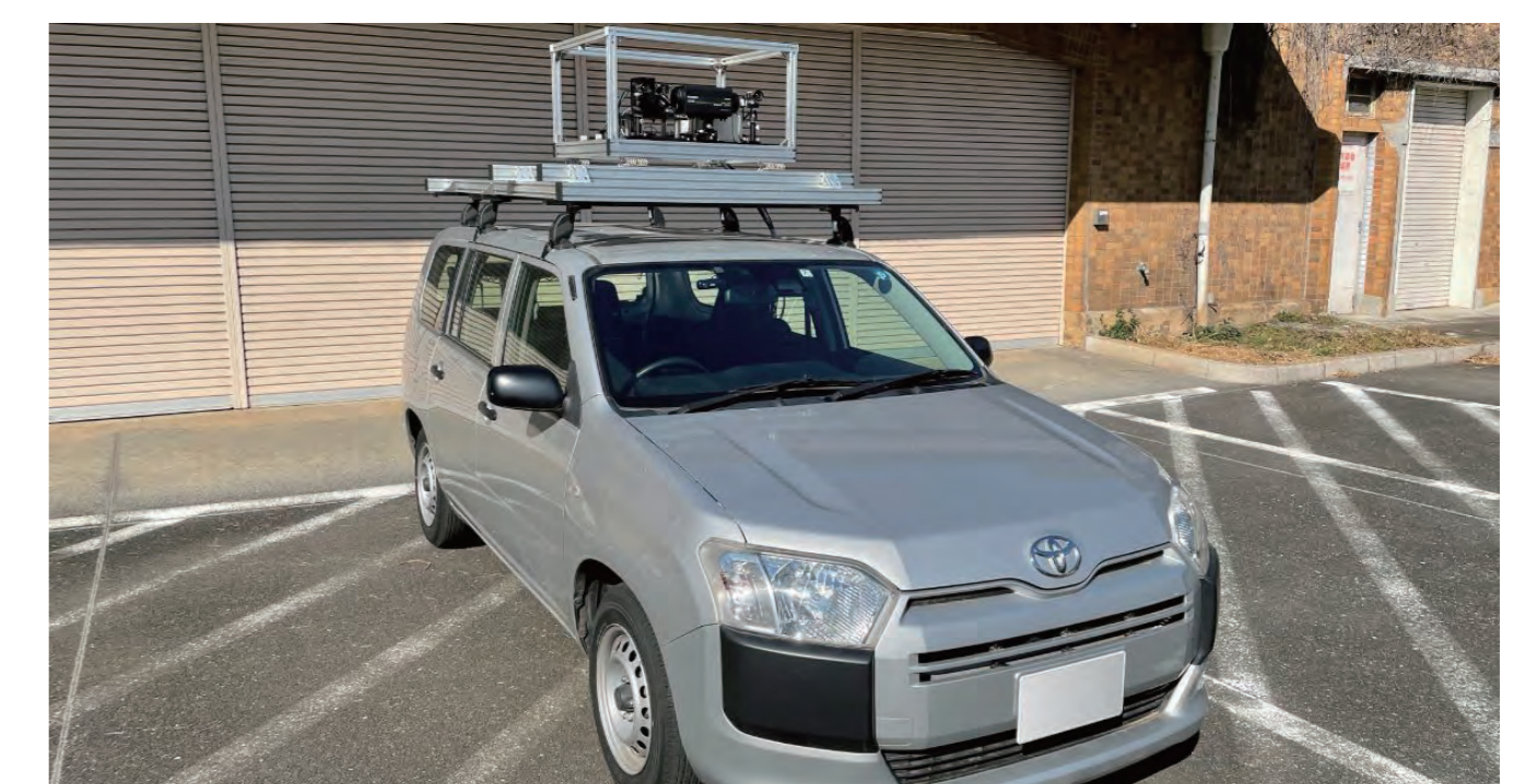
Onboard High-speed Vision

We investigate sensing technologies for vehicles through high-speed, high-accuracy recognition of the vehicle and its surrounding environment using high-speed vision. For example, we propose a novel approach to help vehicles react more quickly when a pedestrian suddenly appears out of a blind spot.