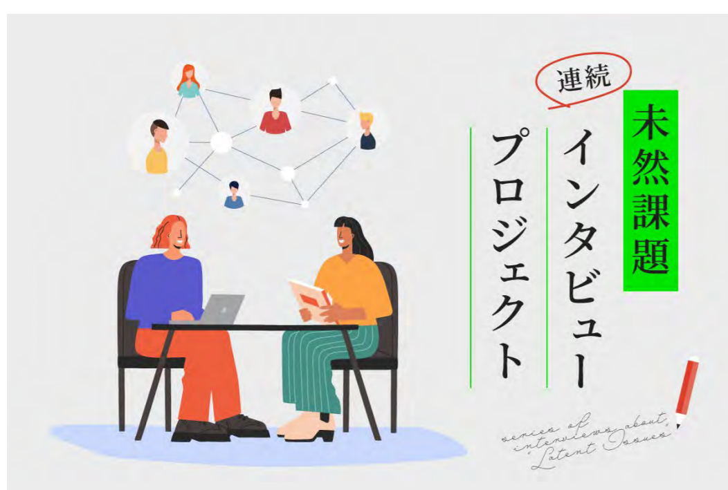
A series of interviews with IIS researchers on the common theme of “latent issues”