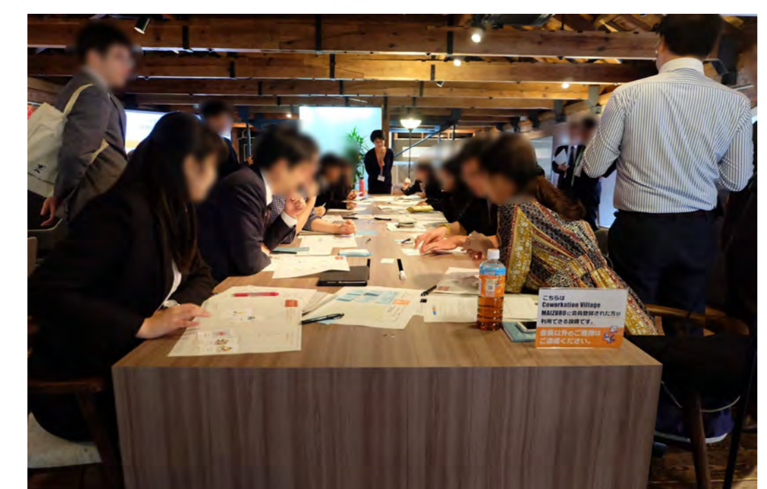
Held a WS for extracting latent issues by tools used in regional cooperation activities at IIS.