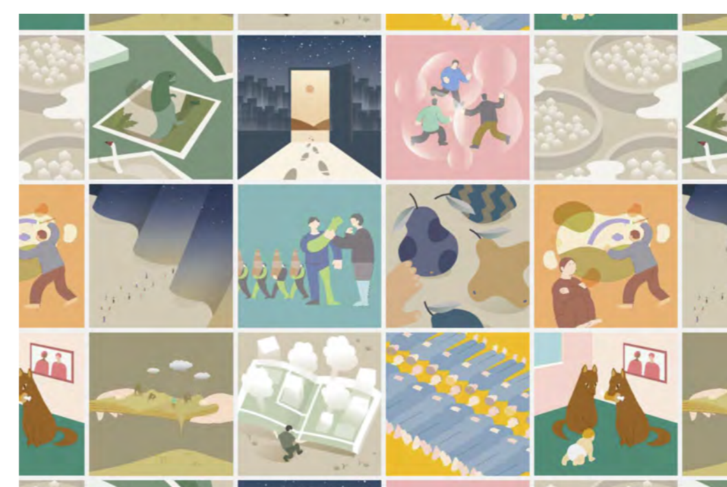
Held an Online WS for high school students across the country applying speculative design.