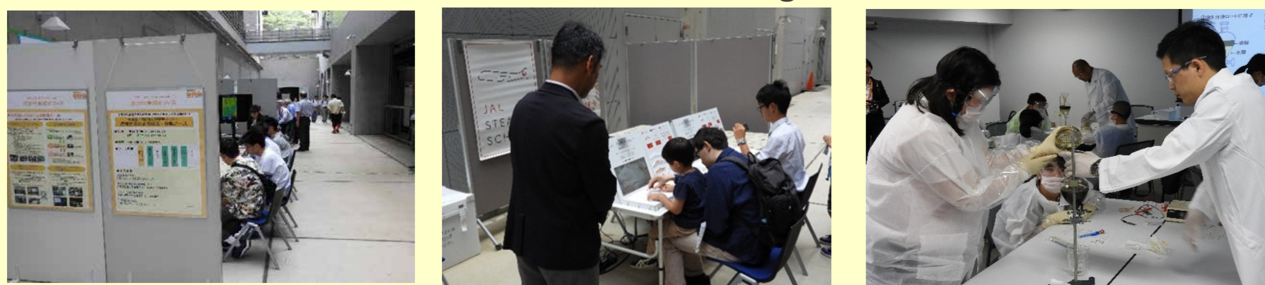
Open House of "KOMABA Research Campus 2018" for Junior High and High School Students