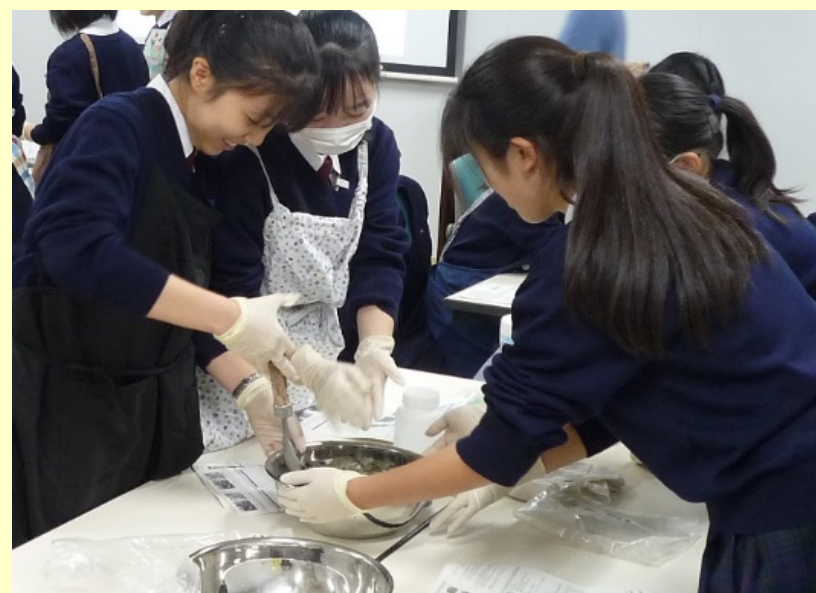
School Outreach Program