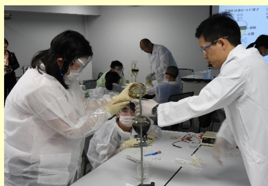
Open House of "KOMABA Research Campus 2018" for Junior High and High School Students