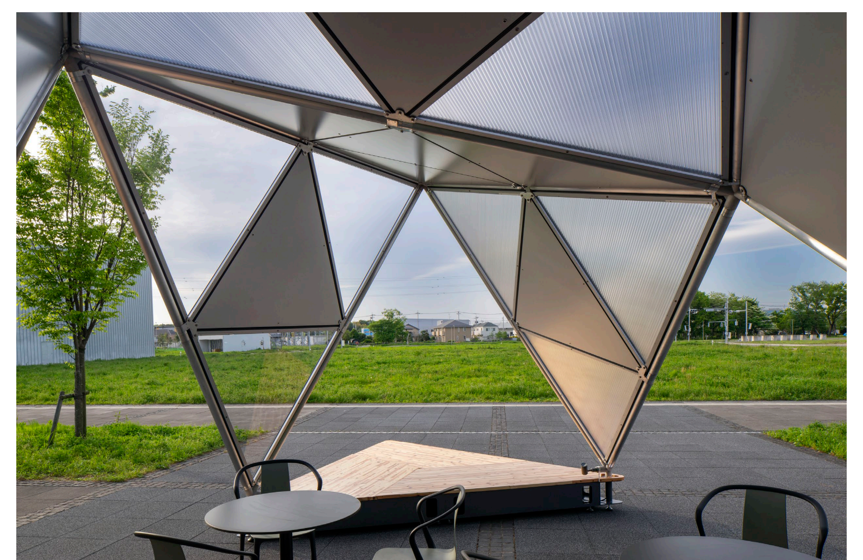
Bright, open interior space *