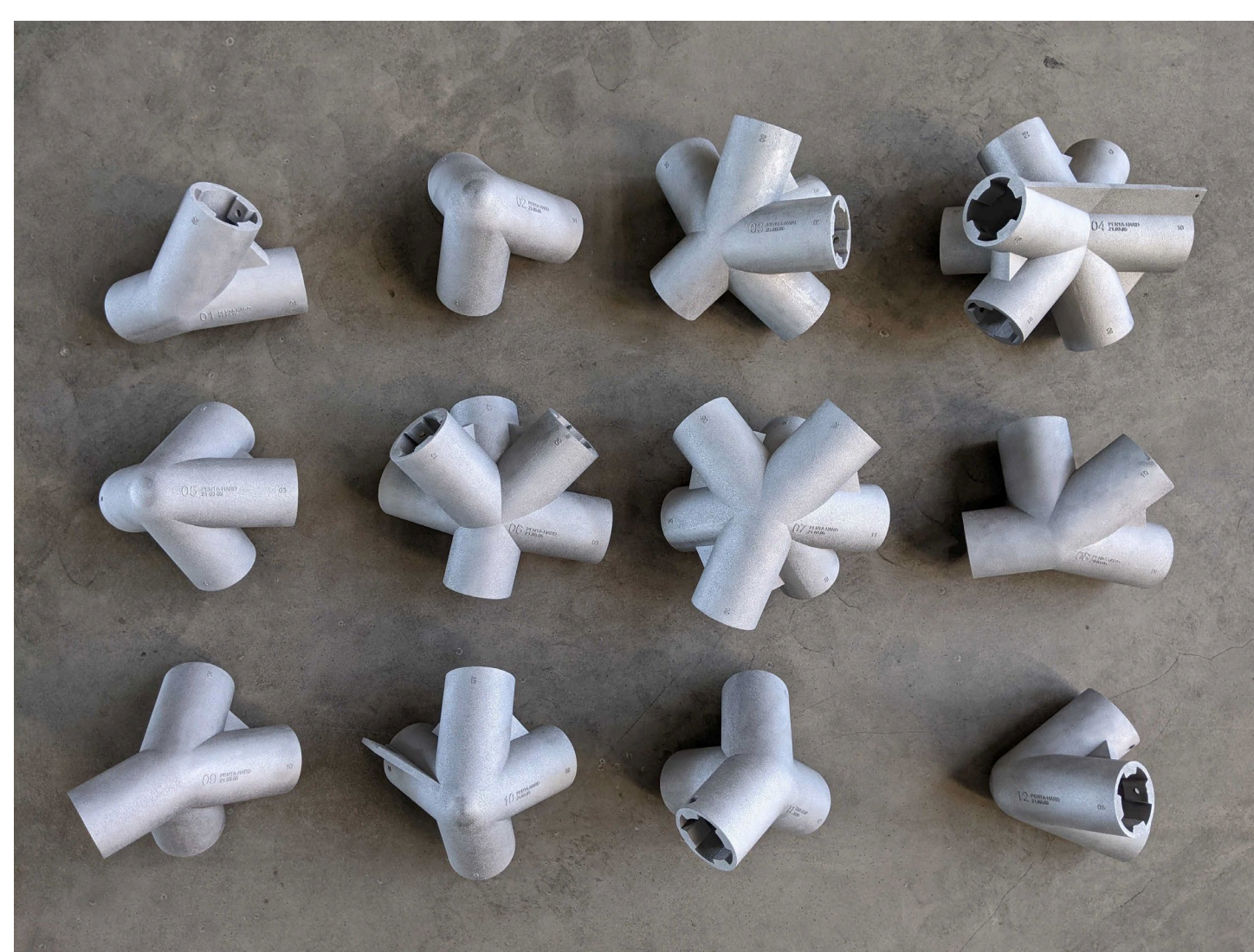
AM Joints with customized outputs depending on the specific angles at which the pipes are attached