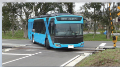
Automated driving bus

Robust Control against Disturbance and Modeling Error