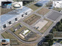
Large-Scale Experiment and Advanced-Analysis Platform, Kashiwa Campus

Experiment fields for automobiles and trains and a driving simulator for large vehicle.