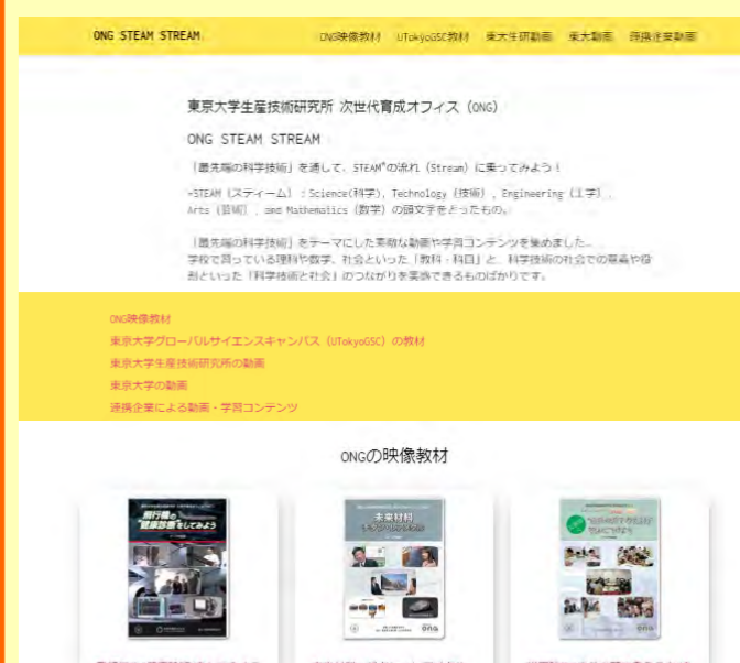
Image teaching materials for STEAM education