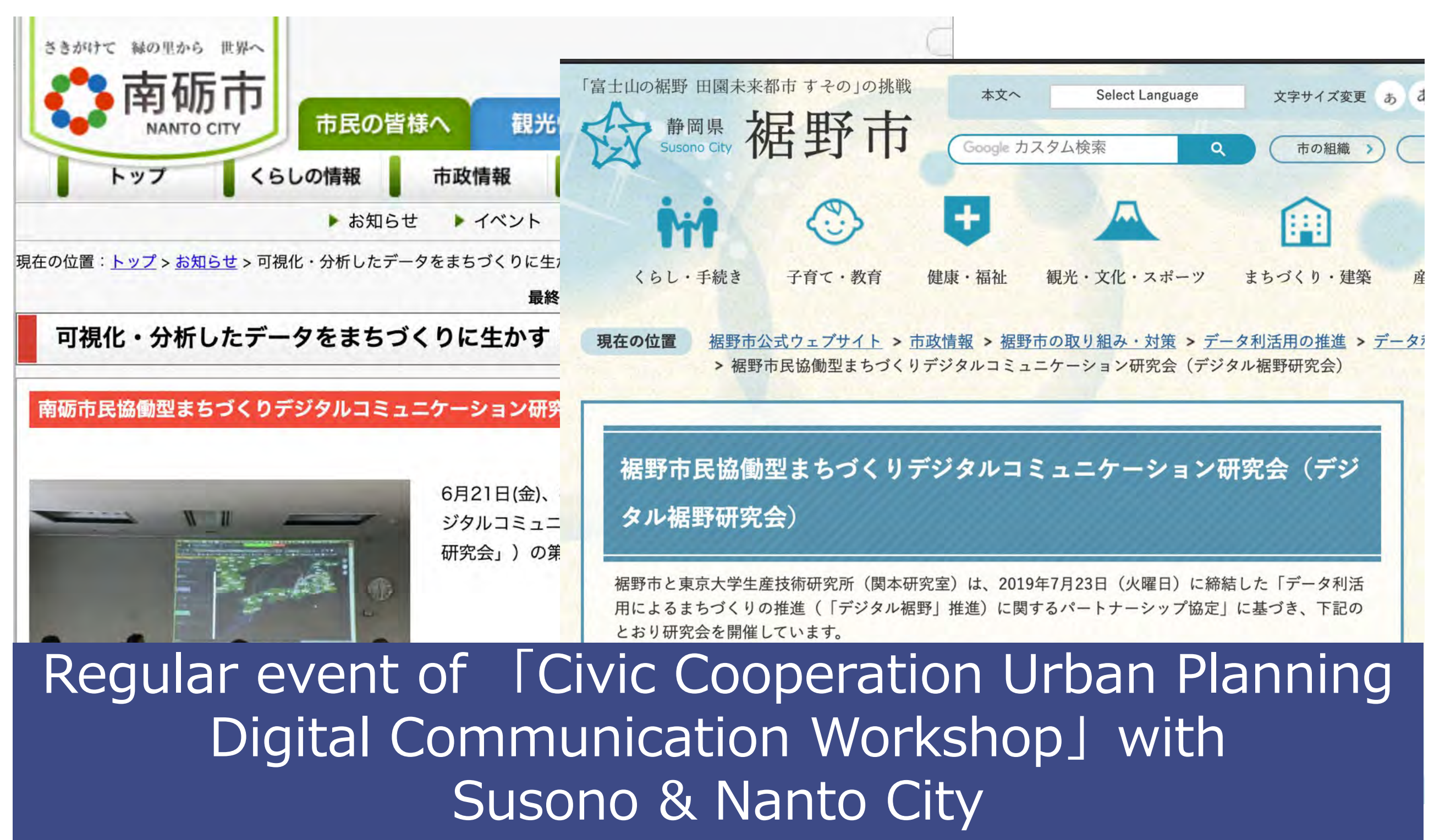
Regular event of 「Civic Cooperation Urban Planning Digital Communication Workshop」 with Susono & Nanto City