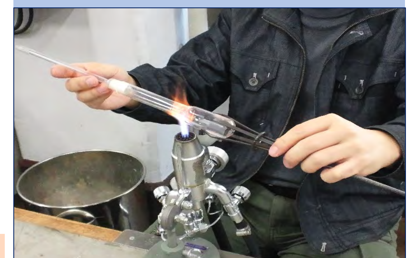
Glass processing (metal filled)

Main mechanical equipment: Turning center, machining center, wire electric discharge machine, milling machine, ordinary lathe, three-dimensional measuring machine, surface grinder, Tig welding machine and others, glass lathe, etc.