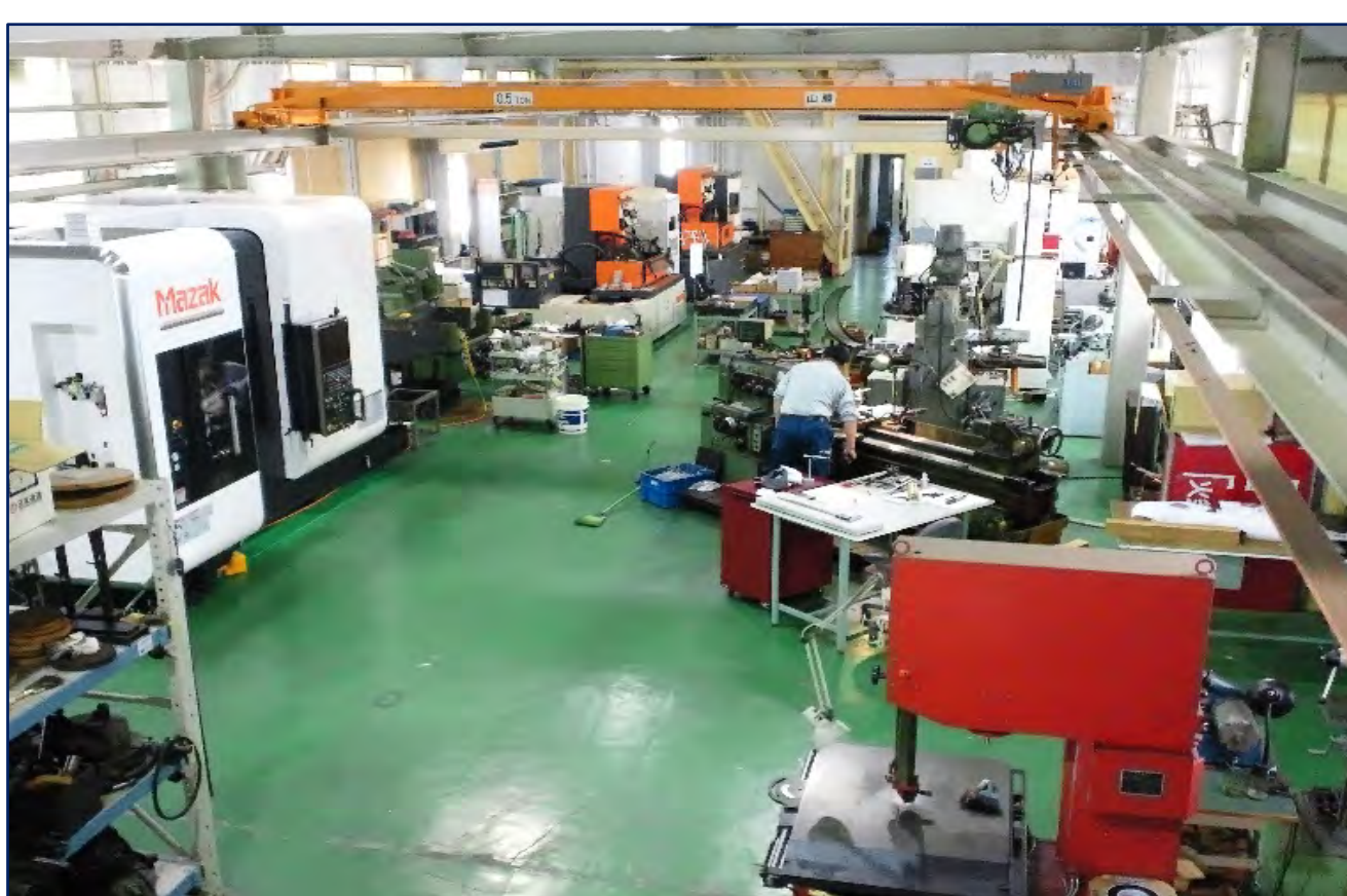
Machining technology room