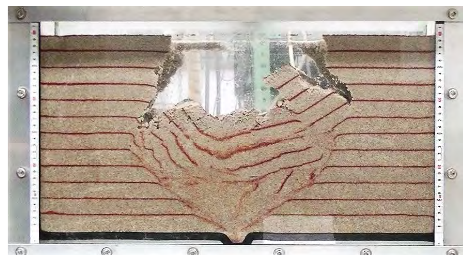
Simulation of road cave-in accident by laboratory model test