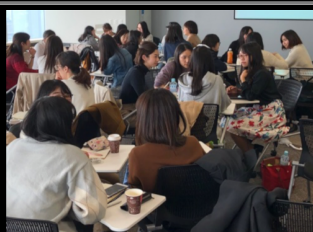
Workshop for girls