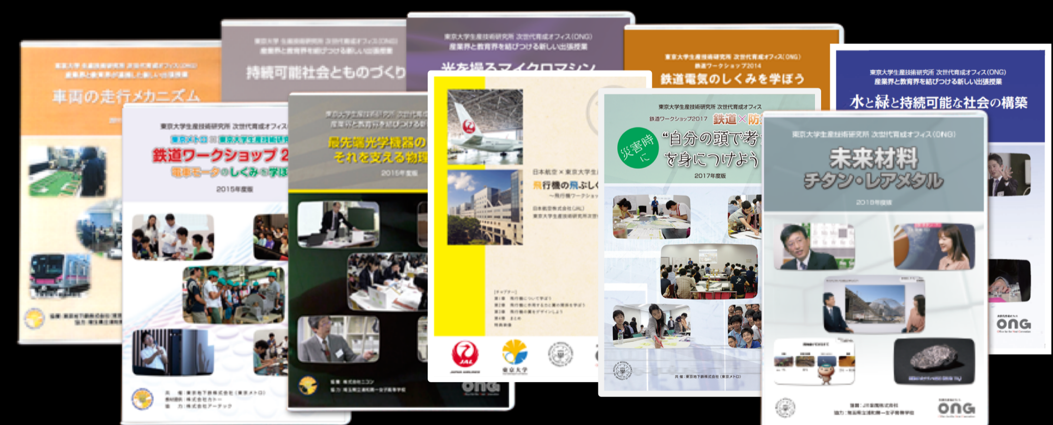
Digital teaching materials (DVD, YouTube)

Science and Technology Communication Activities