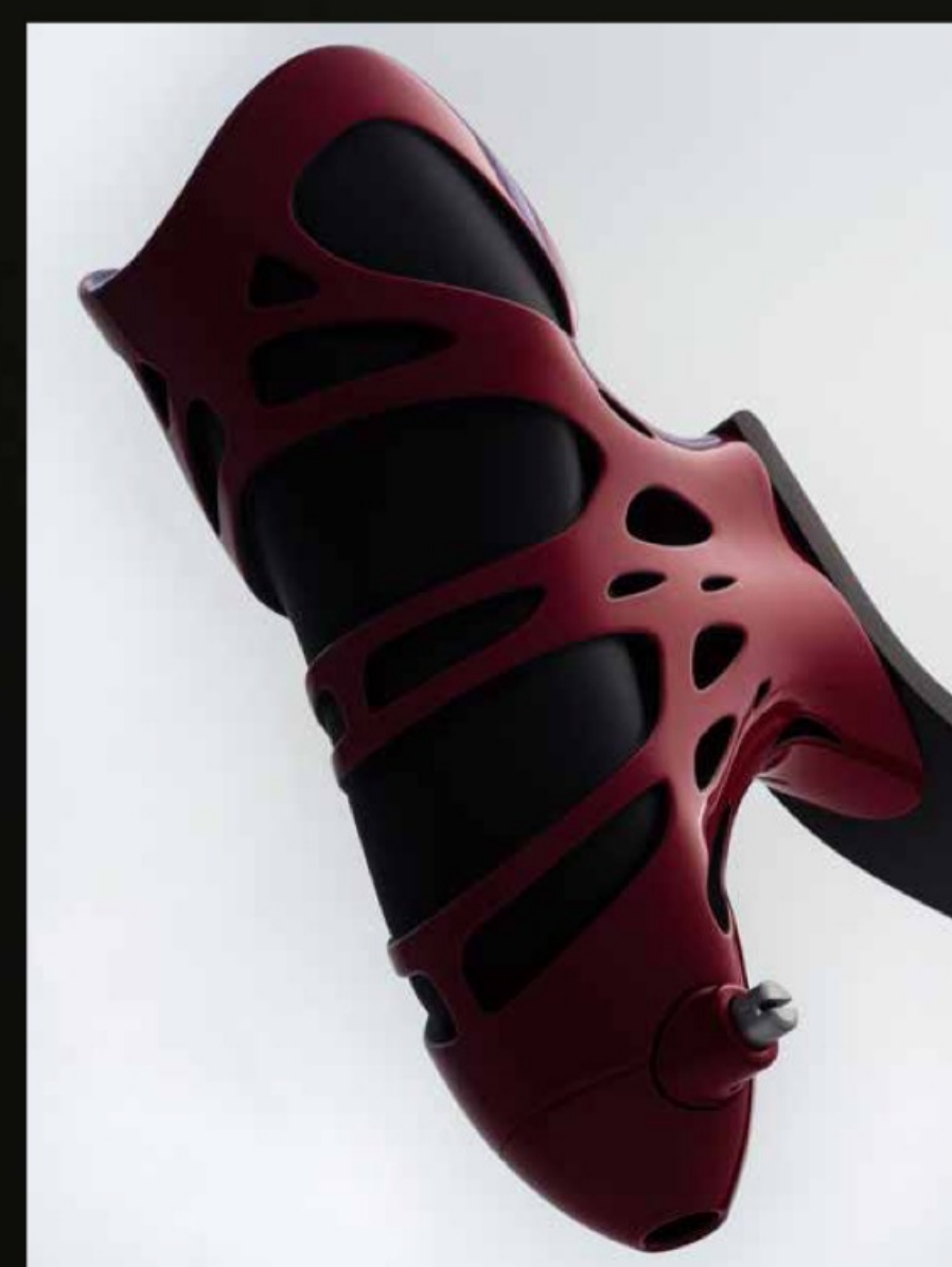
Rami : Additive Manufactured Running-specific Prosthesis