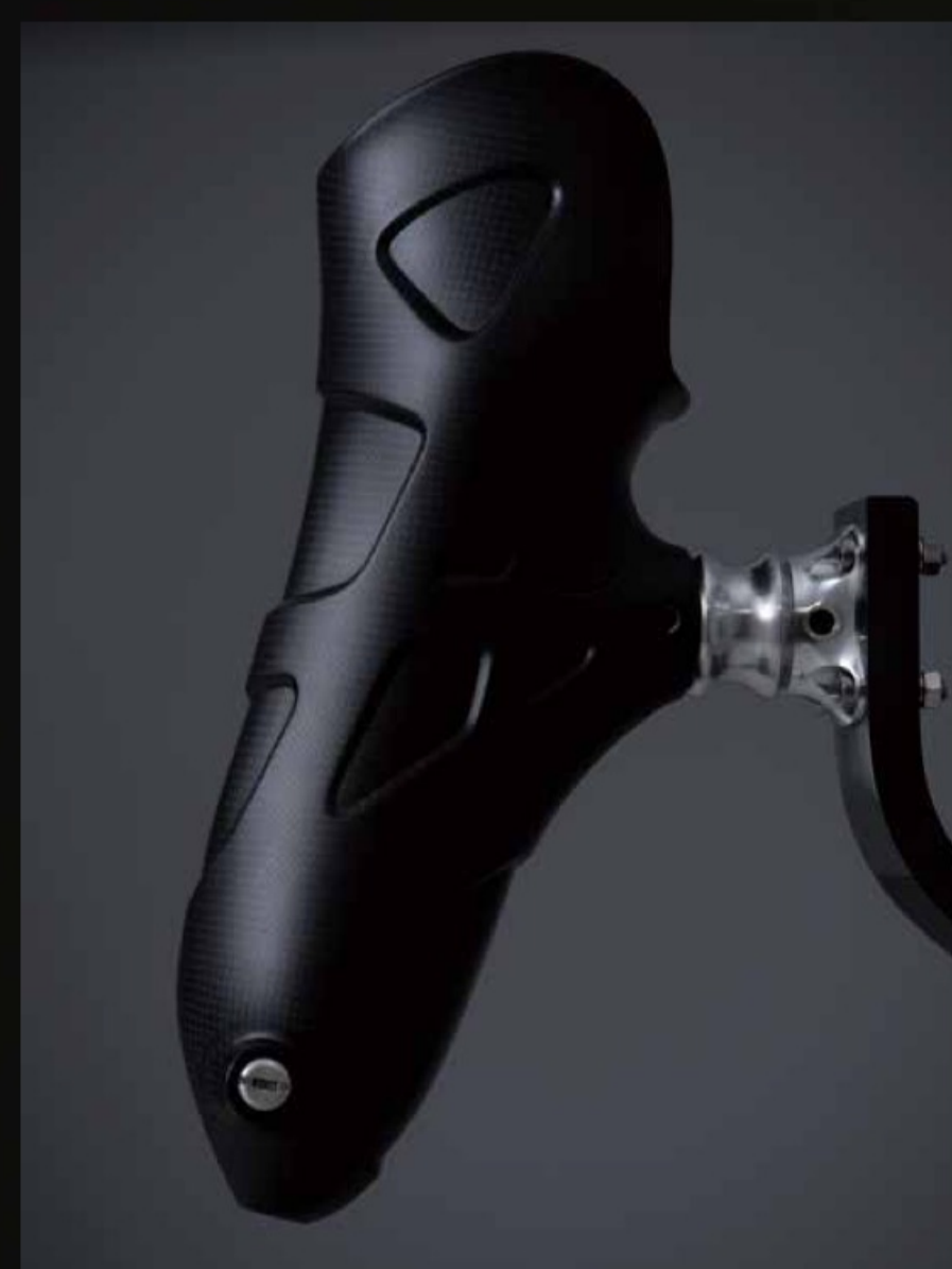
CR-1 : Running-specific prosthesis with dry carbon socket