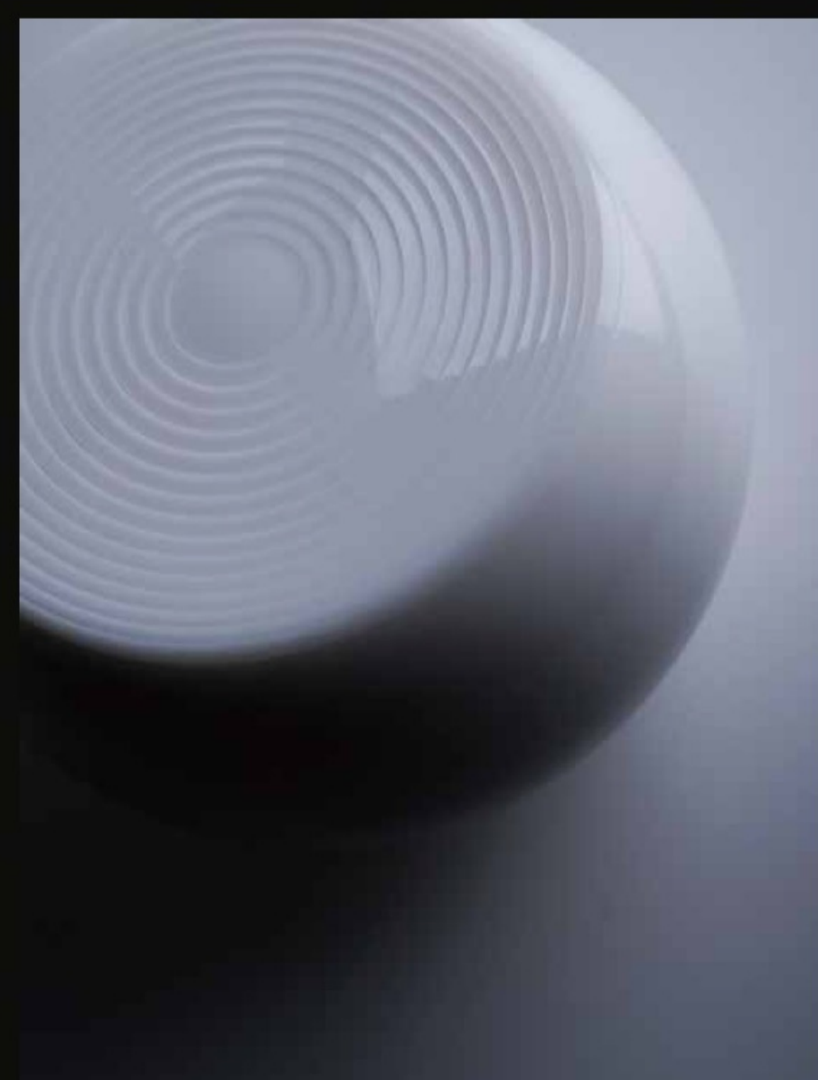
Face on Globe