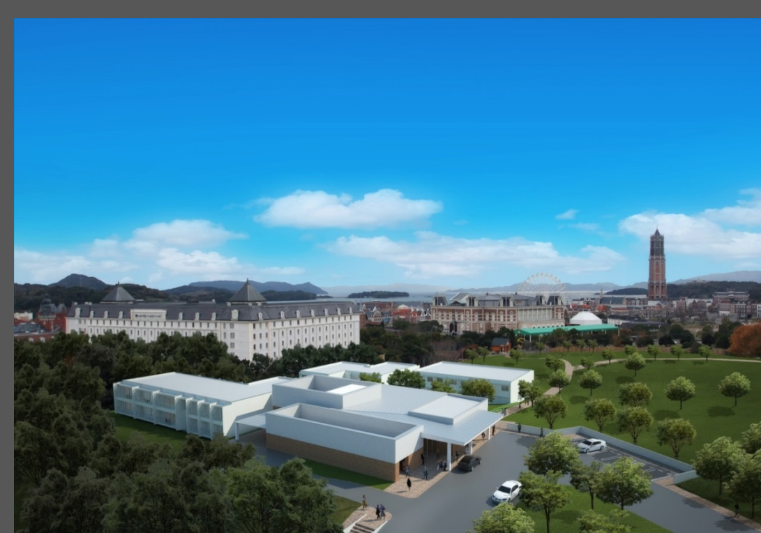
Smart Hotel in Sasebo

In this building's design we focused on improving the indoor air quality without resorting to air conditioning systems. we designed an aperture where radiation and wind passes through the roof to control the distribution of sunlight and air flow to the various rooms.