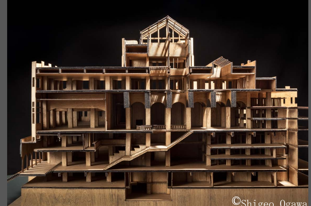
Renovation of General Library

The General Library's new wing, should serve two functions; the expansion of archives, and the creation of new knowledge. By fusing the old and new library, The resulting space will serve as the new base of activity to facilitate interaction and collection of intelligence.