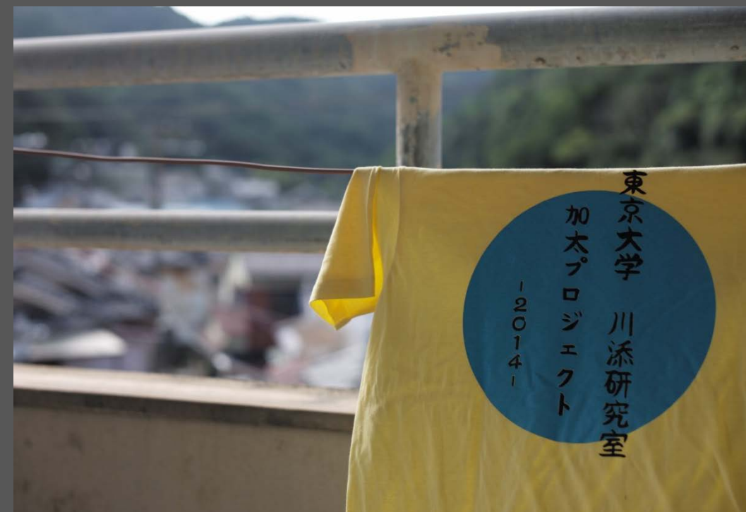
Project in Kada

In cooperation with multiple companies and the local residents we conducted a survey in the historic fishing port of Kada in the Wakayama prefecture. Using the results of this survey, we came up with a proposal to help improve the living conditions and combat pressing issues such as population outflow and aging society.