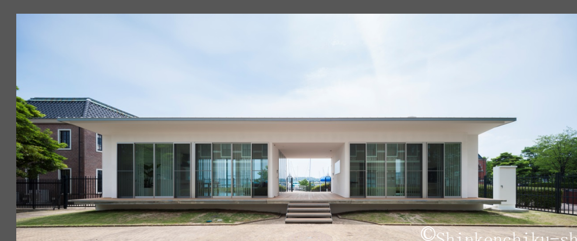
The Pilothouse in Sasebo

Sitting at a corner of a temple in Sano, Tochigi, the residence is required to correspond to the history of the temple and the lifestyle of its owner. In response to the continuity and future changes of the temple, the residence is made of nested wooden frame.