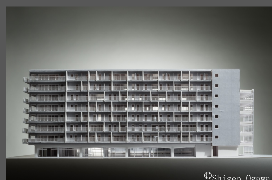
Mejirodai International Hall of Residence