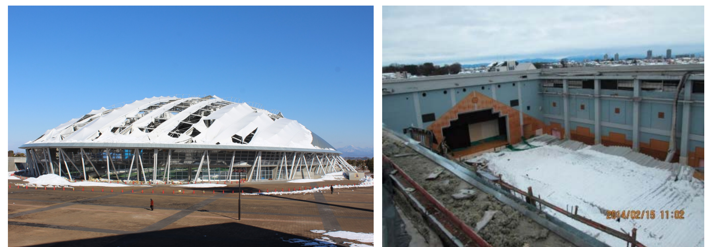
City of Fujimi http://www.city.fujimi.saitama.jp/40shisei/04gyouseizaisei/shingikai/files/tyousa-siryou4-2.pdf (Apr. 15, 2014)