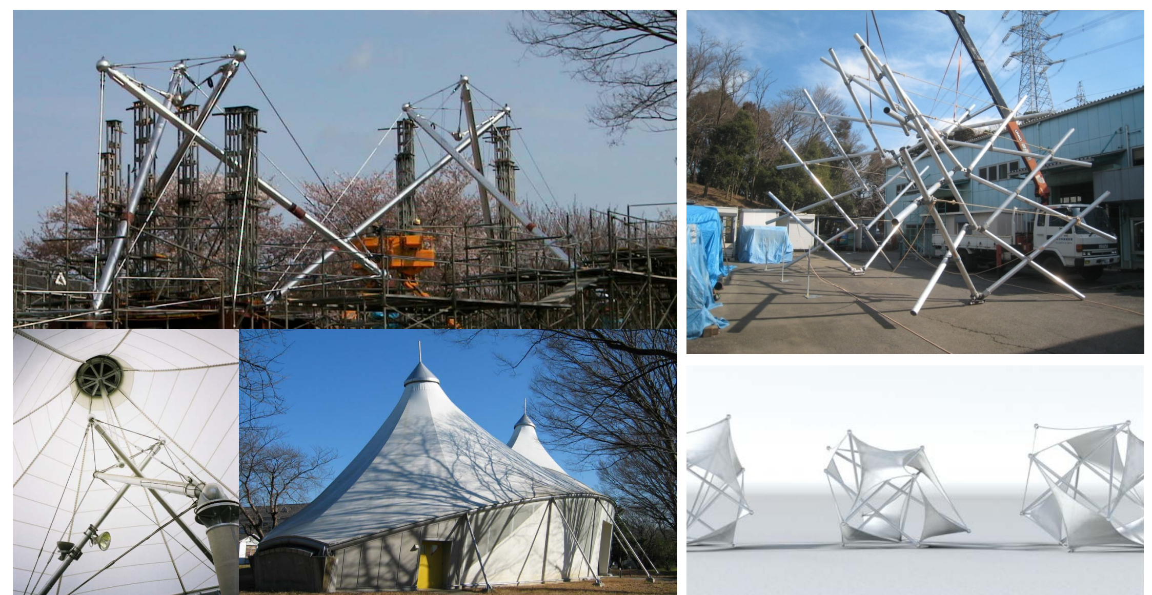
Ceiling reinforcement using cable