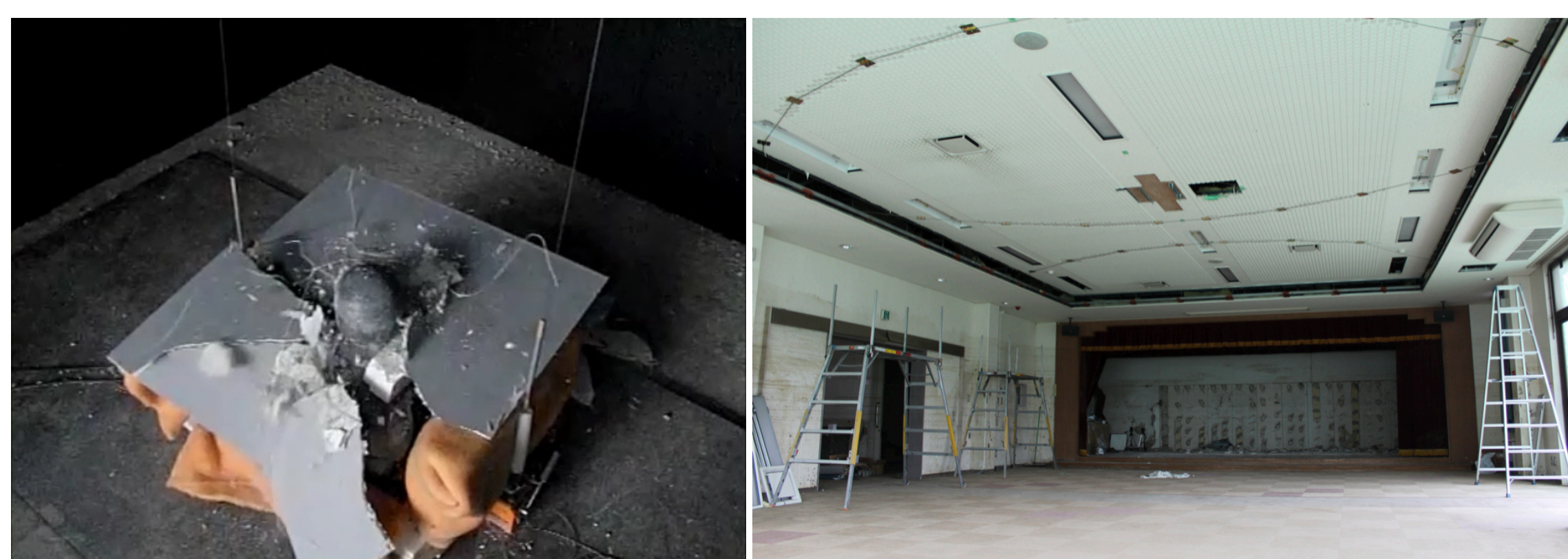
Safety assessment of ceilings by dropping experiments

We have been researching and developing various buildings which practically use advantages of spatial structure.