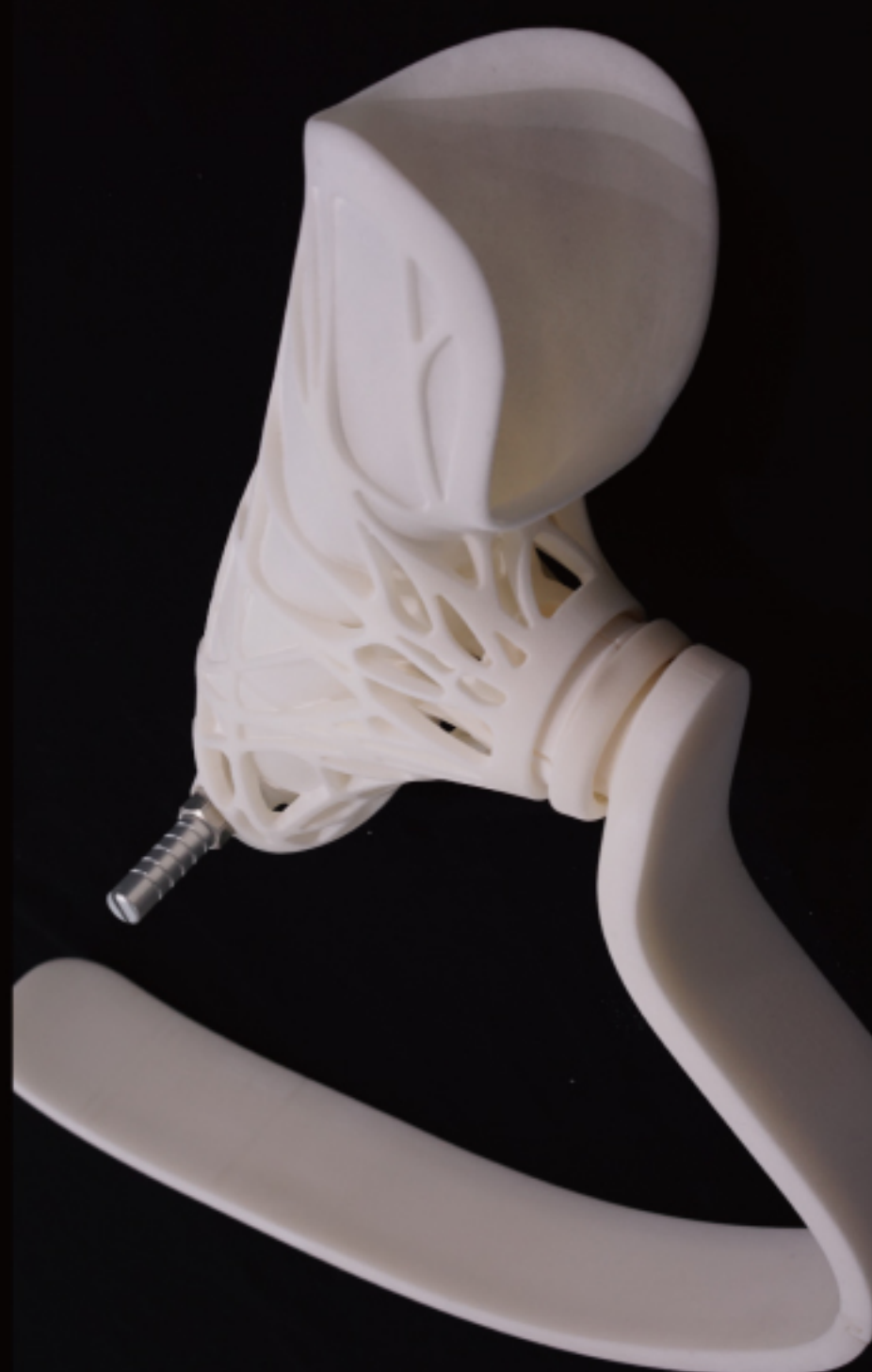
| Running specific prosthetic legs with Additive Manufacturing