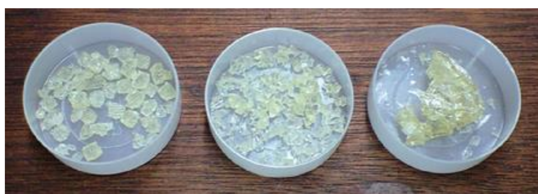
Fig.1 Gelatin gel of various water contents