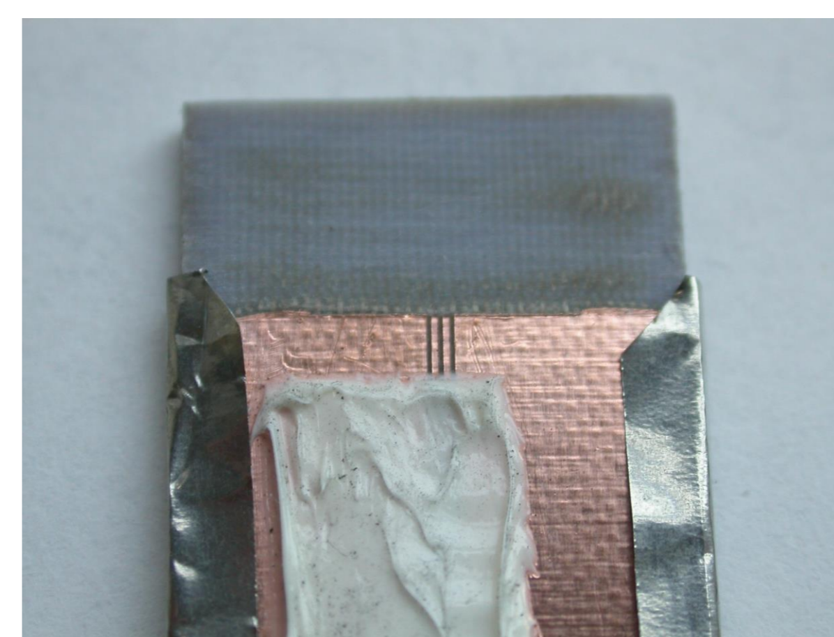
Fig.3 Probe for measuring thin film