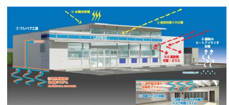
Fig.3 Environment and Energy Conservation Demonstration store ▲ 30% energy saving