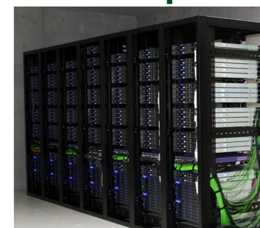
Cloud Computing environment that has more than 1000 cores

Cloud computing -- large-scale on-demand distributed computing environment -- has become very popular. We are trying to develop a new technology to construct cloud applications with dynamic load balancing and fault resilience. Large-scale search problems have some difficulty to apply these techniques, therefore we're focusing on distributed computing platform to develop such applications with ease.