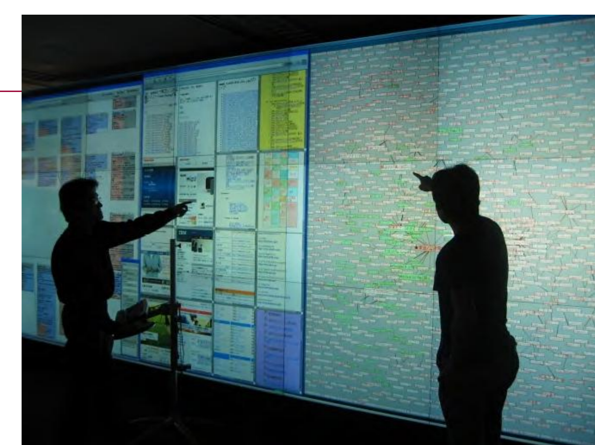
The cyber map visualization system on the display wall

Our lab has continuously collected Japanese Web pages since 1999 and has constructed a Web archive system including over 16 billion pages. We are trying to develop an analysis system based on the Web archive. We have then constructed an interactive visualization system to show a cyber map that is a result from structural and temporal analyses on a large display wall.