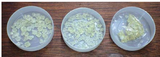
Fig.1 Gelatin gel of various water contents