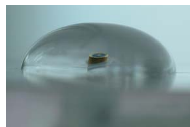
Fig.4 Probe for measuring droplet