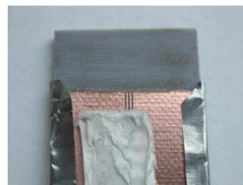
Fig.3 Probe for measuring thin film