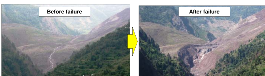
Landslide dam that was formed by the 2005 Kashmir EQ failed by moderate rain in 2010

The occurrence of extreme weather events such as heavy rainfalls and severe droughts will undeniably result in a higher incidence of natural disasters such as landslides. Assessing the effects of wetting and drying cycles is of prime importance in the failure of slopes or embankments composed of slakable geomaterials.