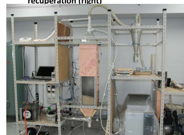
Fluidized bed dryer

Biomass contains a large amount of moisture which deteriorates the heating value of biomass. Conventional biomass drying technologies require a large amount of energy, especially oil. Thus, an innovative biomass drying process by using heat recuperation technology is proposed and developed. The heat from biomass is recuperated and circulated in the system to reduce the energy consumption of the system.