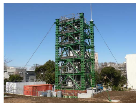
Large scale circulating fluidized bed cold model in Chiba Experimental Station (height 16 m, diameter 0.10 m)

Advanced Integrated Coal Gasification Combined Cycle (A-IGCC) and Integrated Coal Gasification Fuel Cell Combined Cycle (A-IGFC) is proposed to make a highly efficient power generation by exergy recuperation. In this power generation system, coal gasification is carried at low temperatures and the heat required in the gasification is provided by the steam from exhausted heat of a high temperature gas turbine or a fuel cell. To complete these cycles, 1) an integration methodology of gasification furnace and gas turbine 2) a flux and density solids circulation system in cold model are investigated.