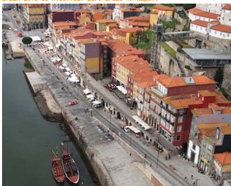
port areas in Porto (Portugal)