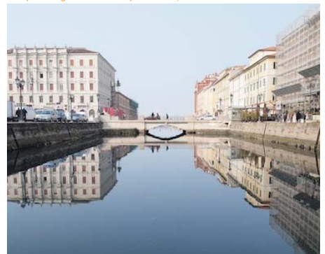
Trieste : Grand Canal