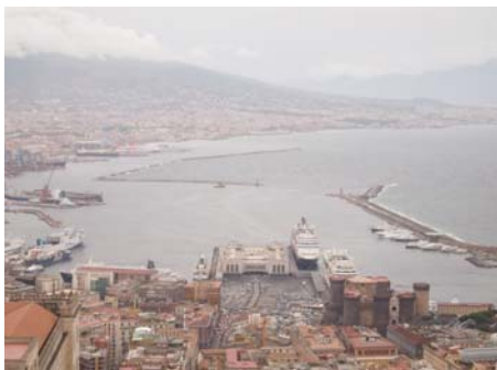
urban axis to historical port areas in Napoli