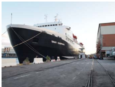
port areas in Napoli