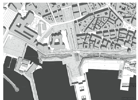
The planning of historical port areas / Reference : SUDEST FINAL REPORTS