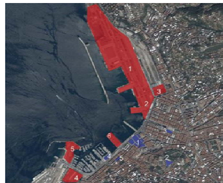
port areas in Trieste / Reference: CTUR City news NO.3