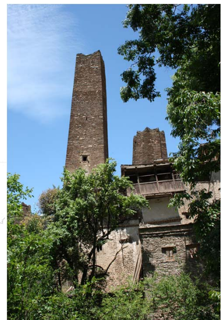
rGalrong-Tibetan in Sichuan Province