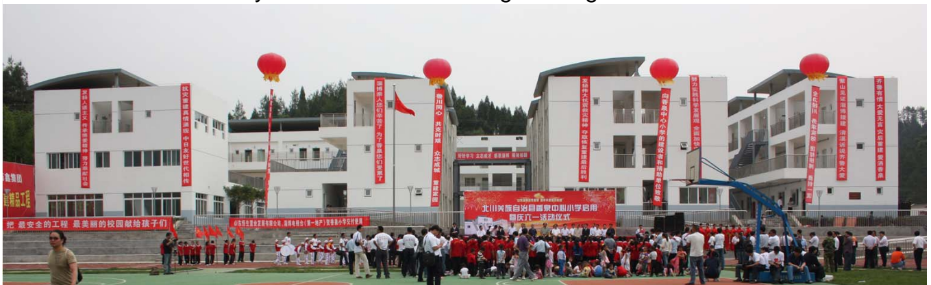
Xianguan Township Central Primary School (2009)

For the reconstruction of the Sichuan Earthquake in 2008, we designed Xianguan Township Central Primary School . Thanks to the support from around the world and Chinese government, it became the first primary school completed and came into use after the disaster. The project features architectural style of Qiang, the small ethnic group in the area. Children of Qiang stay and study here. This is one of the practical results of our field surveys on traditional dwellings throughout the world.