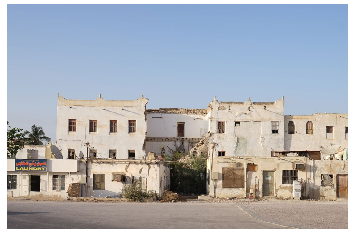
(2) Preservation of traditional houses in Oman Fig. A traditional house destroyed by cyclone