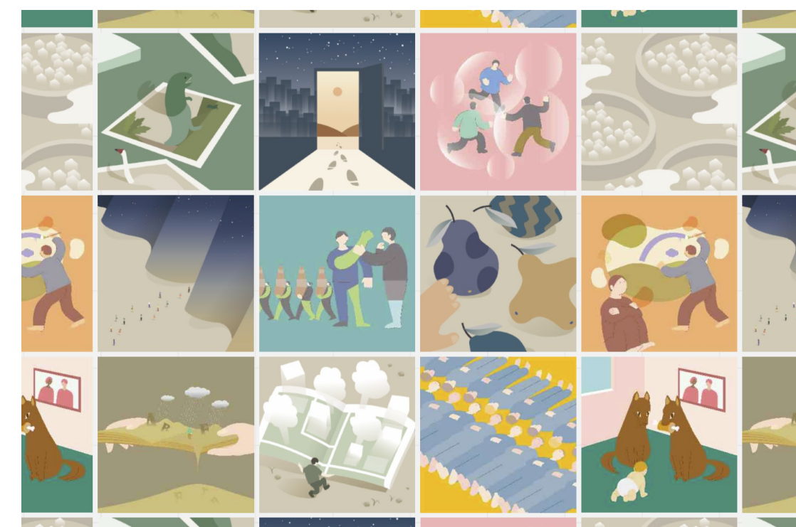
Held an Online WS for high school students across the country applying speculative design.