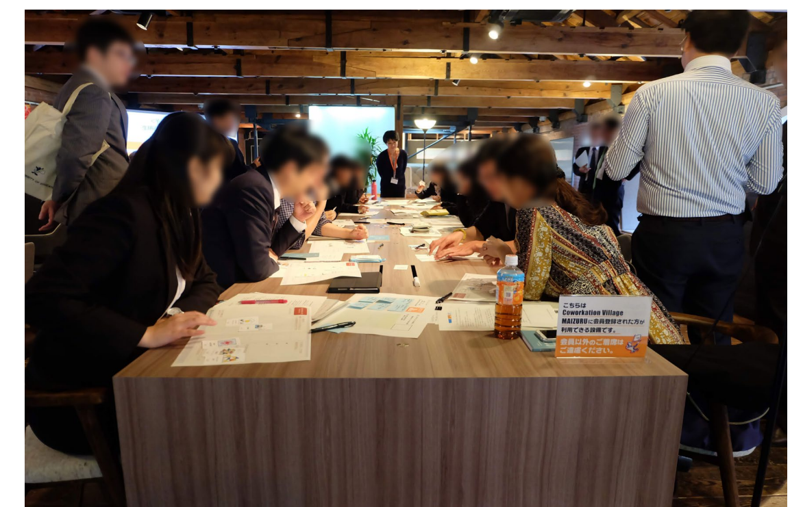
Held a WS for extracting latent issues by tools used in regional cooperation activities at IIS.