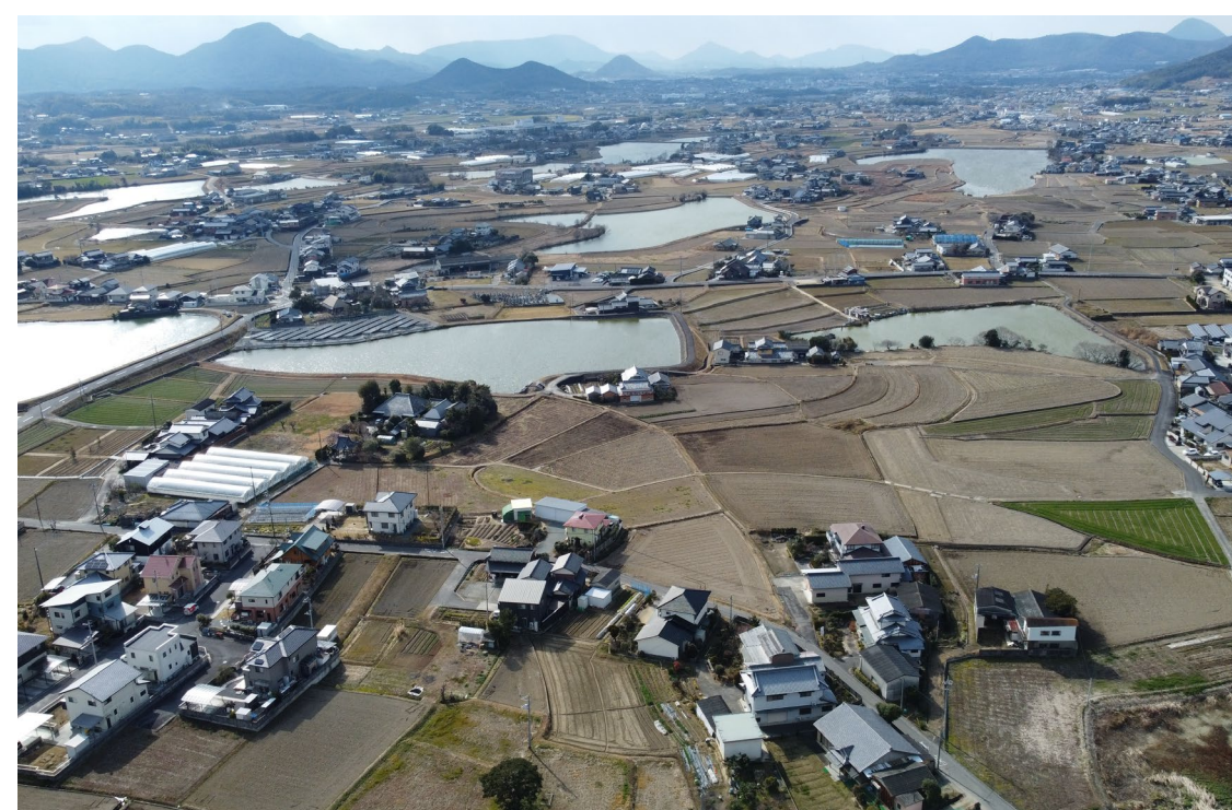
(1) Surveys in areas with low population density Fig. A landscape of Ayakawa Town, Kagawa Pref.