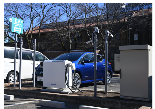
Building up an EV charging testbed utilizing IoT (at Parking Lot of Komaba Research Campus)