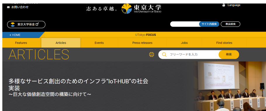
Social Implementation of Infrastructure for Interconnection among any IoT Systems (Press Conference in May 29, 2019) https://www.u-tokyo.ac.jp/focus/ja/articles/z0205_00056.html