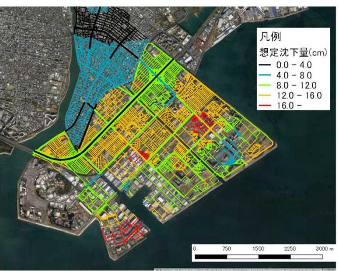
Newly-developed liquefaction hazard map for road network in Urayasu City