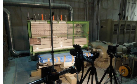
Pull-out test and shaking table model test on newly developed Geo-cell reinforced retaining wall