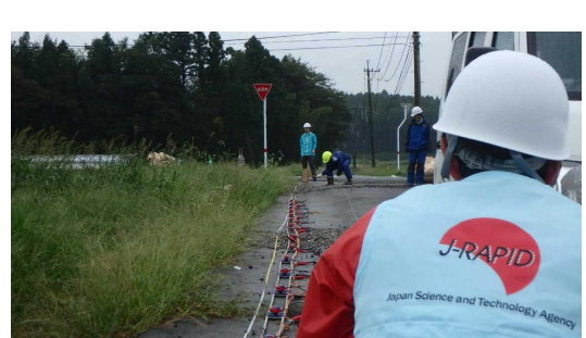
Field survey after geo-disaster