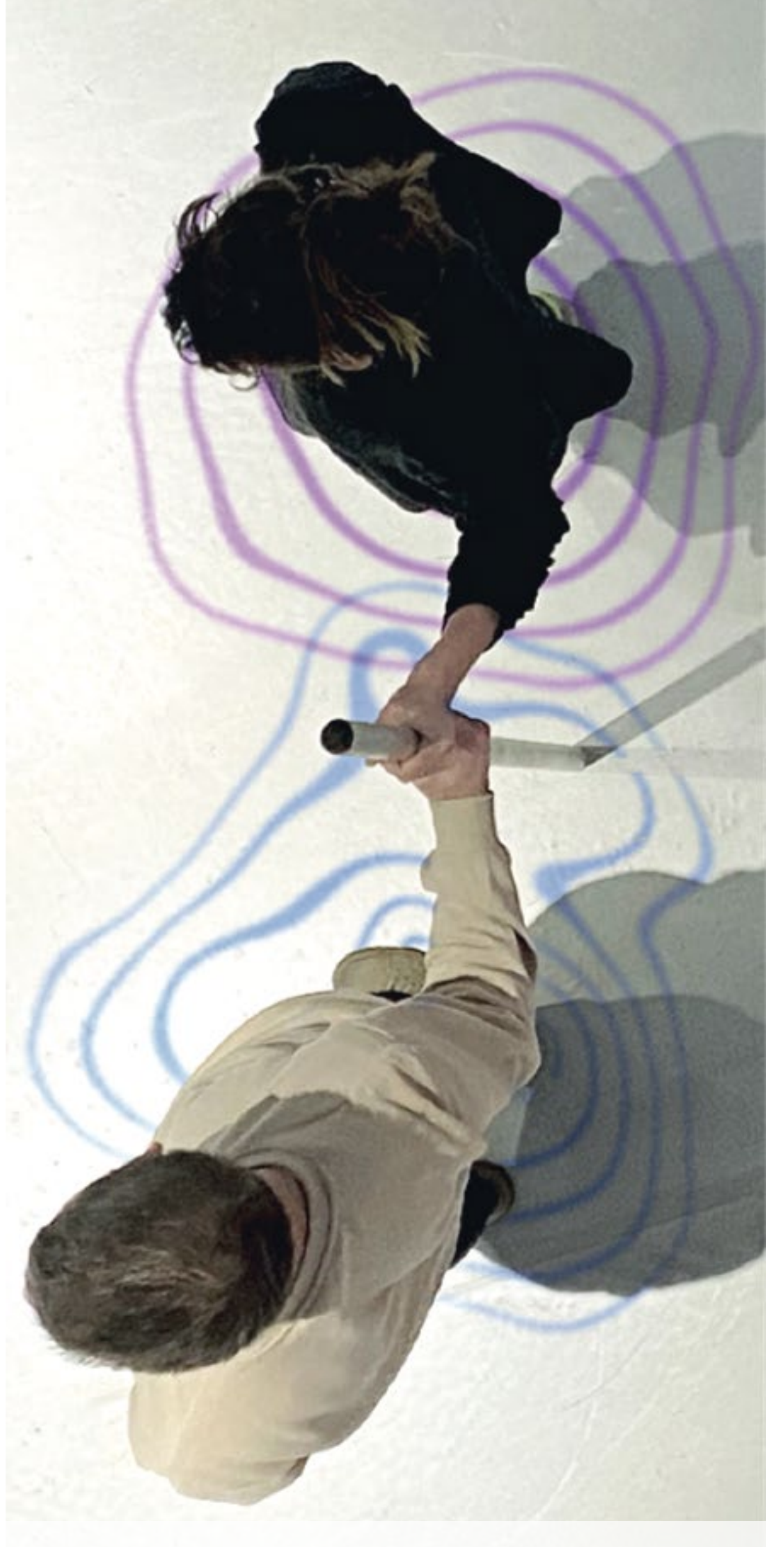
Future Mobility Creation