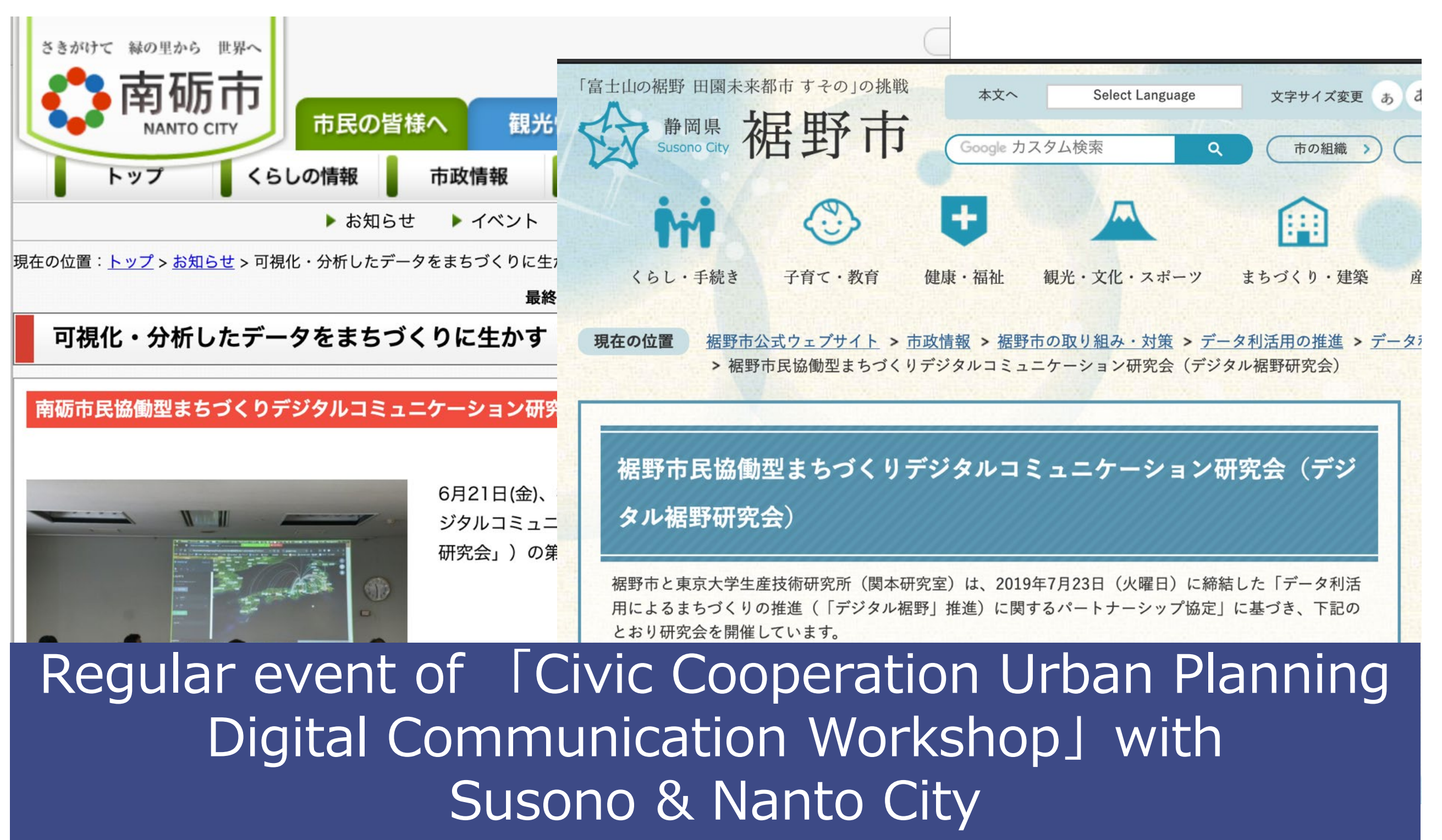
Regular event of 「Civic Cooperation Urban Planning Digital Communication Workshop」 with Susono & Nanto City