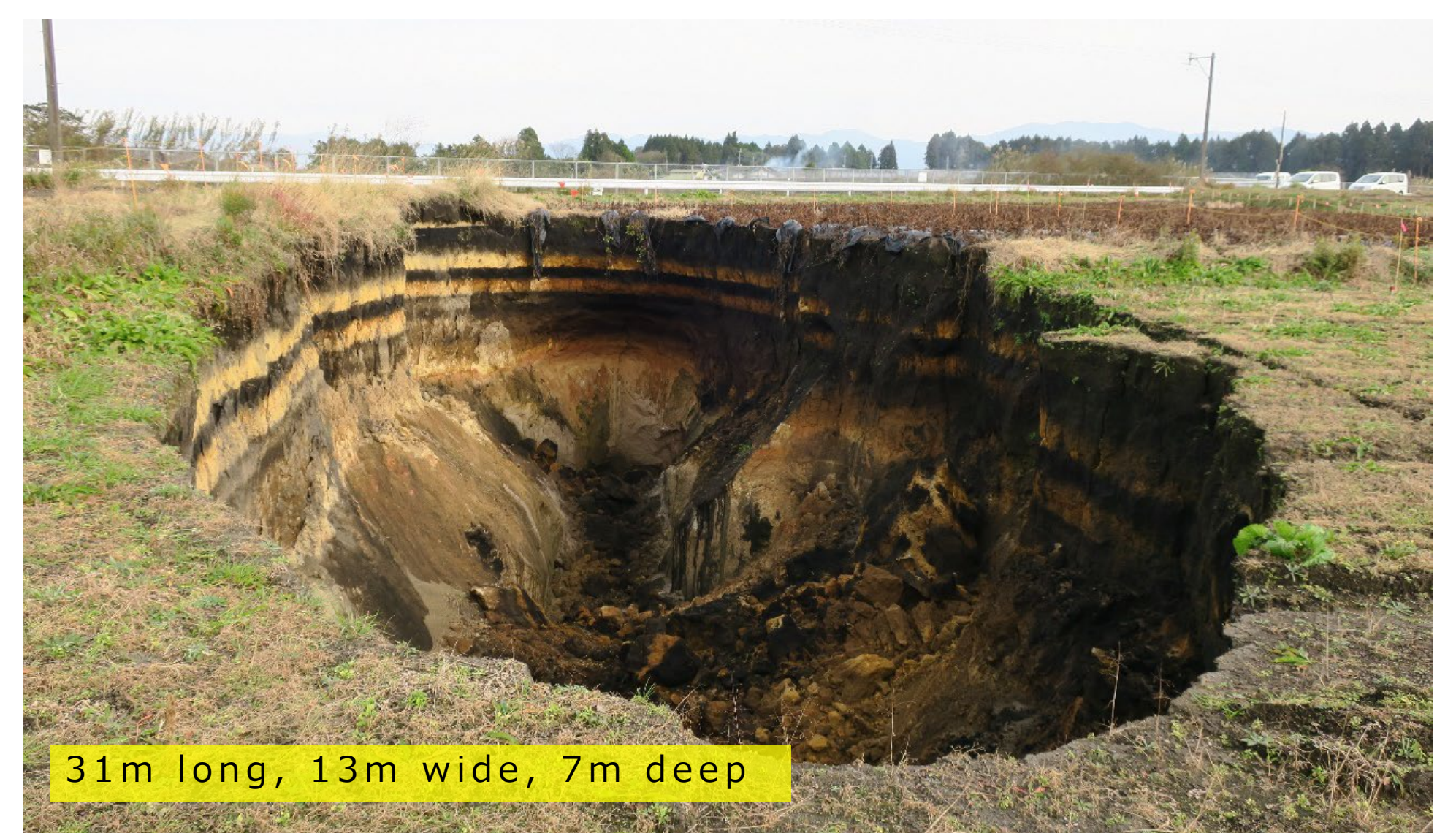
Sinkhole caused by internal erosion in volcanic "Shirasu" layer in Miyakonojo, Miyazaki (Sept. 2016)

By repetition of erosion and failure of cavity ceiling, a cavity moves upward