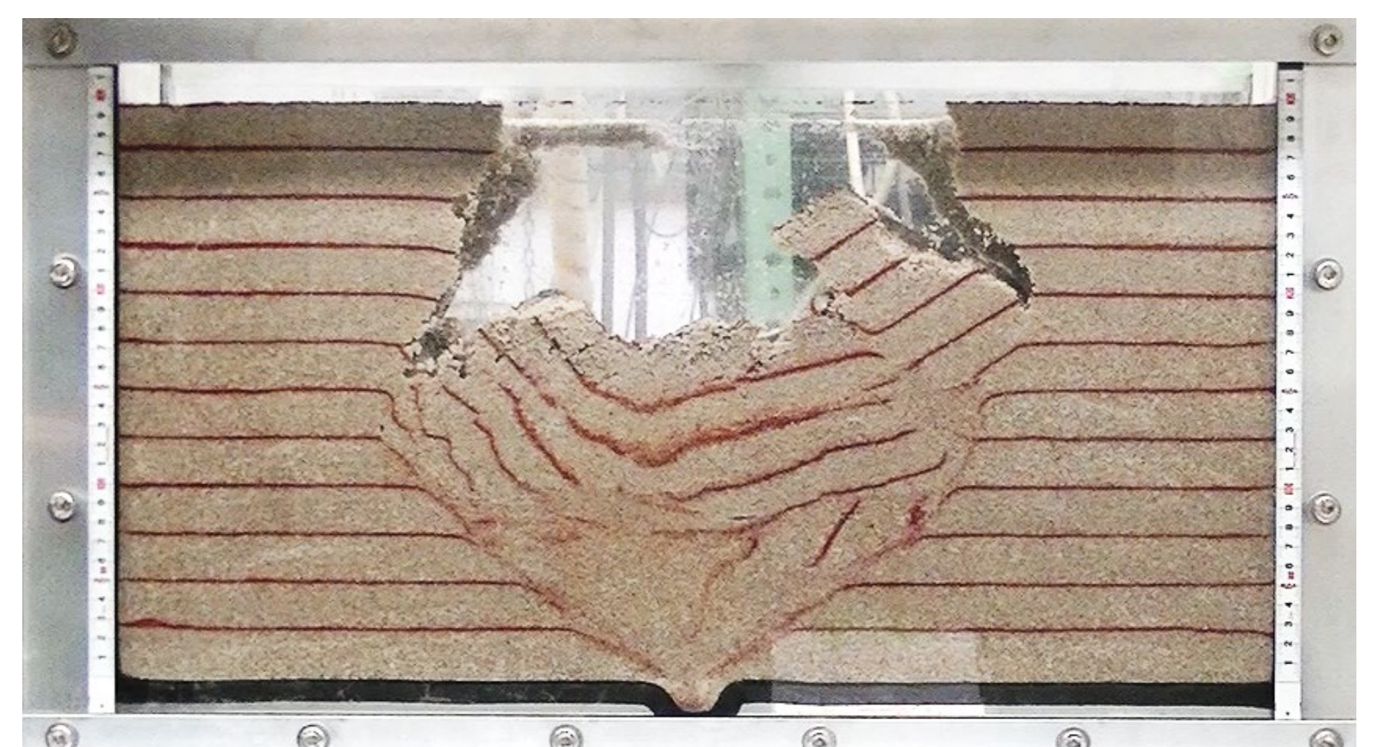
Simulation of road cave-in accident by laboratory model test