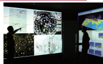
Huge-scale spatio-temporal visualization system on the display wall

Our lab has continuously collected Japanese Web pages since 1999 and has constructed a Web archive system including about tens of billions of URLs, billions of blog articles, and tens of billions of tweets. Based on this peta scale archive, we are developing structural, contents, and temporal analysis systems including information diffusion extraction, inter-media comparison, and real-time deep text analysis. The cyber space information is integrated with physical space information such as mobility data for traffic analysis. Results of analysis can be interactively visualized on a large-scale high-resolution display wall.