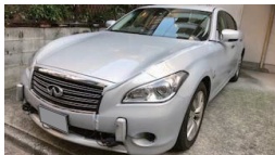
Road Surface Vision

We investigate sensing technologies for vehicles through high-speed, high-accuracy recognition of the vehicle and its surrounding environment using high-speed vision. For example, we are developing systems for vehicle's posture estimation and localization by capturing and analyzing proximate road surface.