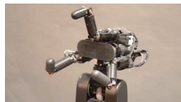
High-speed Robot Hand

Our laboratory has been developing high-speed robot system including high-speed vision, high-speed image processing, sensor network and sensory feedback. For example, we developed a high-speed robot hand which can perform speed of 180^\circ / 0.1s .