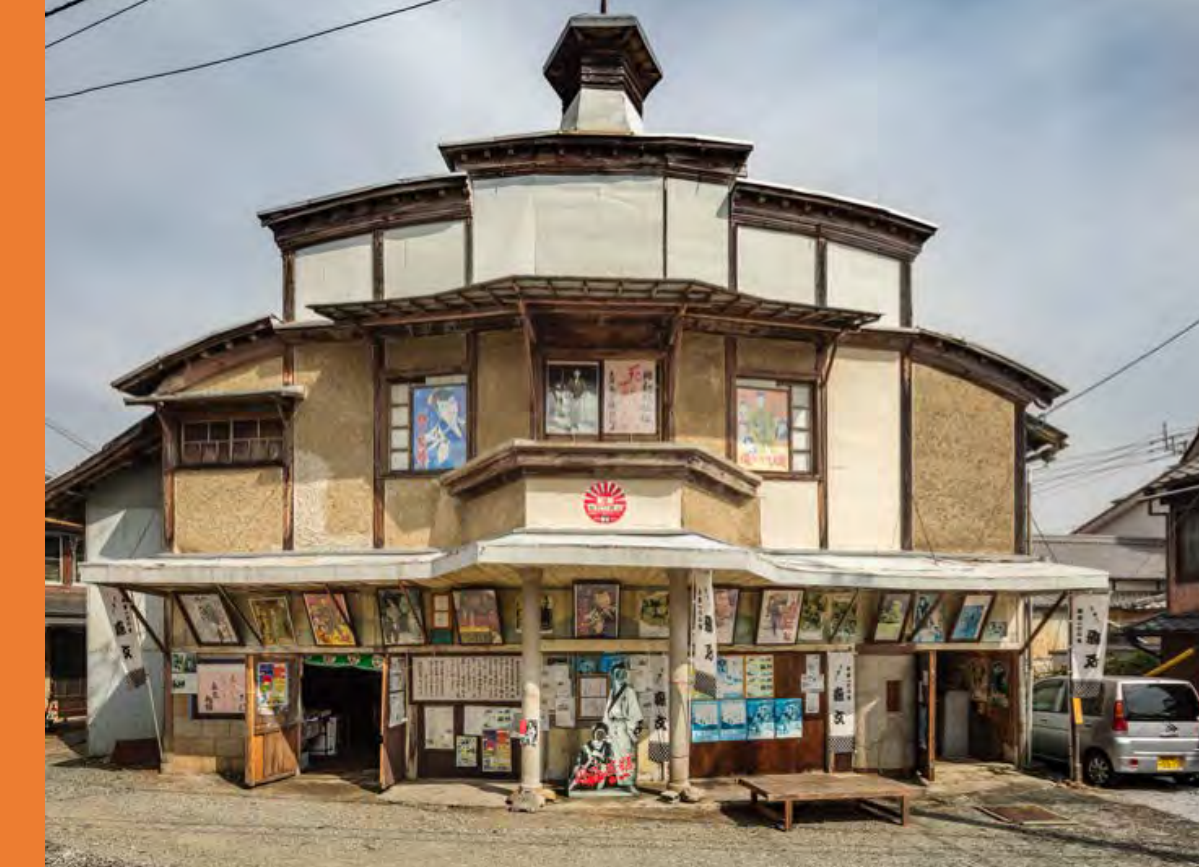
Moribun Asahikan (Ehime, Uchiko,1926): Before becoming Nakanaka heritage, wasn't considered heritage at all but merely a regal facility.