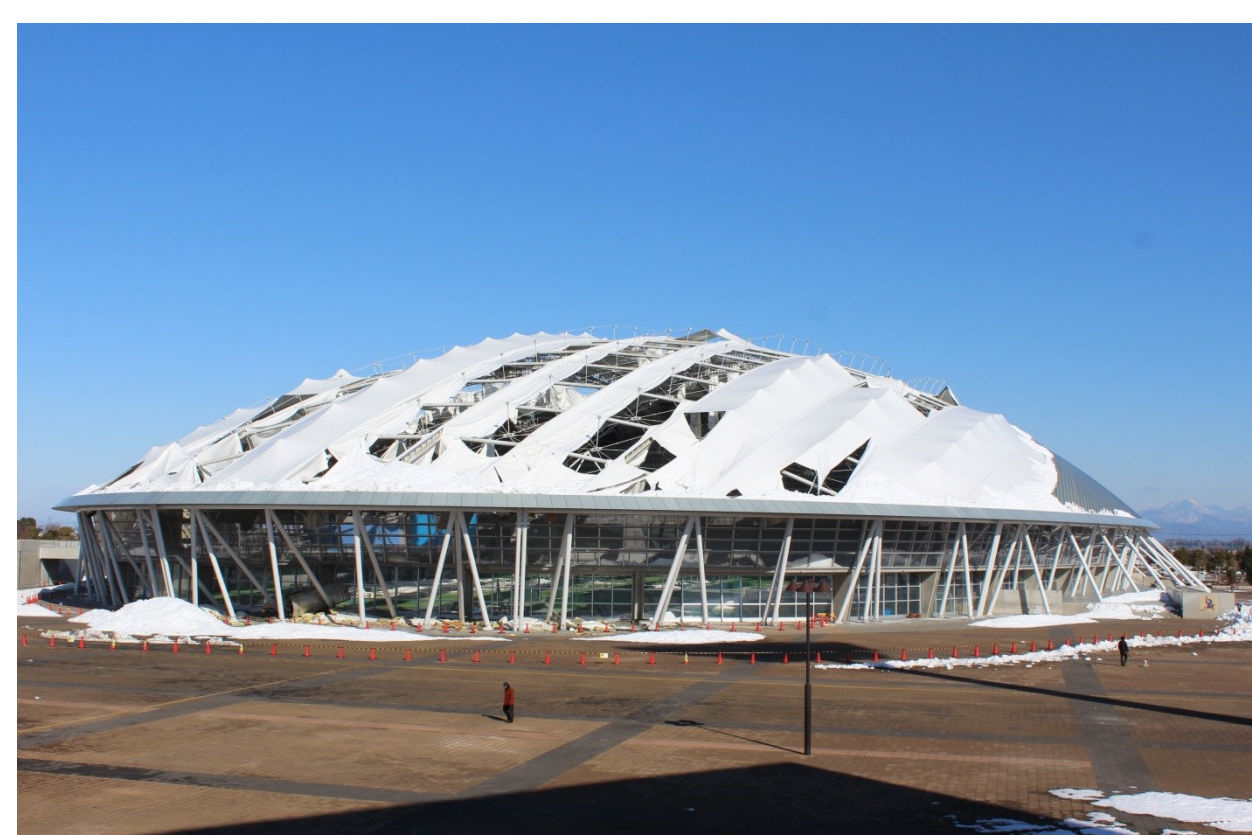
Roof collapse due to the heavy snowfall on Feb. 14, 2014