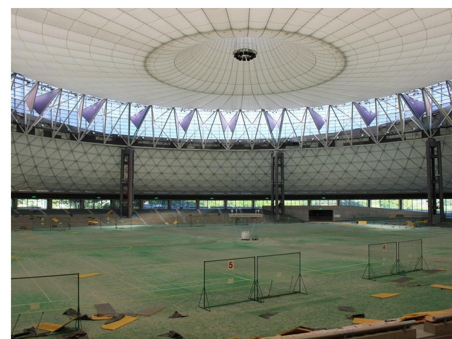
2016 Kumamoto Earthquake