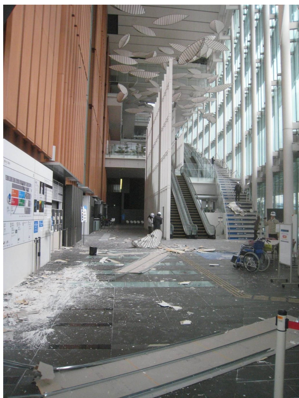
Great East Japan Earthquake

During the main and after shocks of the East Japan Earthquake on March 11, 2011, failures of non-structural components had occurred in many large roof buildings. Harming people due to the falling of ceiling panels had occurred as well. We have been investigating the safety of large roof buildings and developing the method to prevent the falling of ceilings.