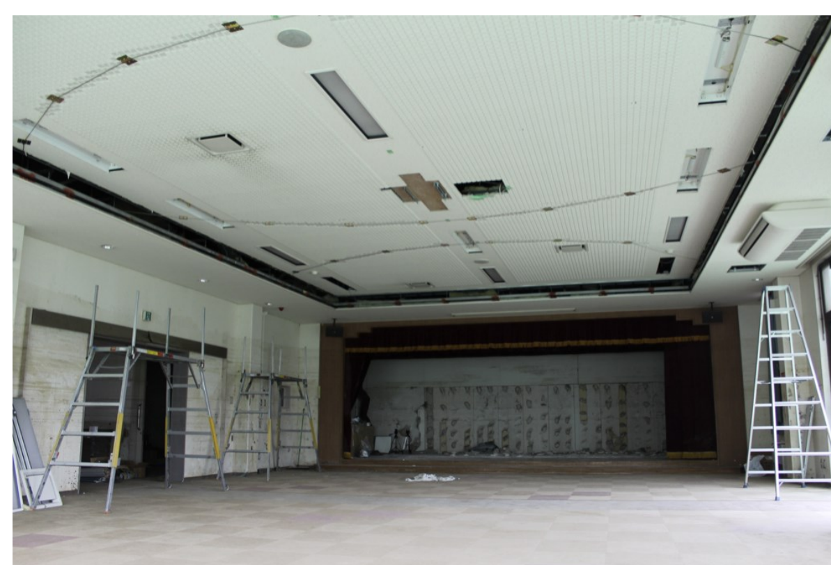
Ceiling reinforcement with cables