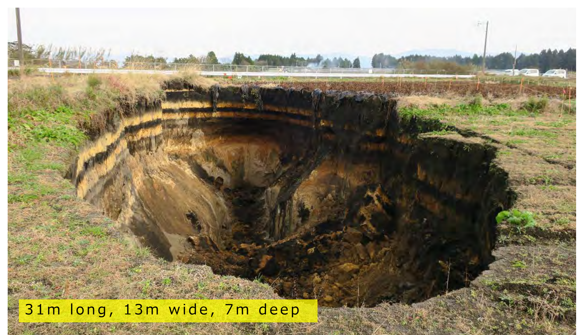
Sinkhole caused by internal erosion in volcanic "Shirasu" layer in Miyakonojo, Miyazaki (Sept. 2016)

By repetition of erosion and failure of cavity ceiling, a cavity moves upward