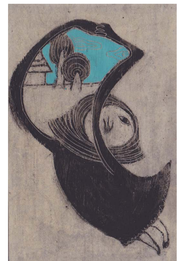
Fig1. Homo Fenestrator

Yet if we consider the window as means of interaction between the human being and the environment, material or immaterial, it may be supposed that the very action of creating the window allows us to distinguish another type of human being. Derived from the latin fenestra (window) and the verbal suffix ator meaning creating or making, we define the contemporary human as homo fenestrator or man, making windows (Fig1).