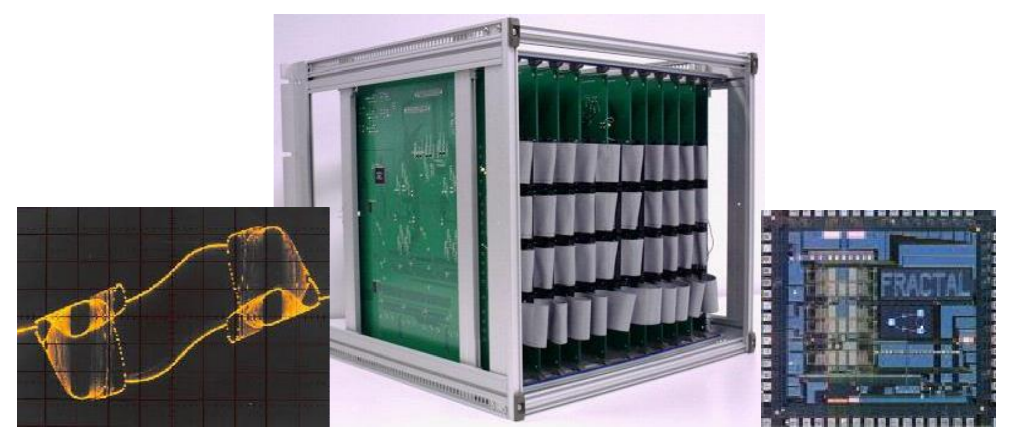
Applications of chaos and fractal: analog silicon neuron and chaotic neuro computer

We are trying to clarify the mechanism of real neural networks and to reveal the high-order functions of the brain through developing mathematical models of neurons/neural networks and identifying underlying non-trivial mathematical structure. As an application, we are also developing analog silicon neural networks and AI in collaboration with Kohno lab.