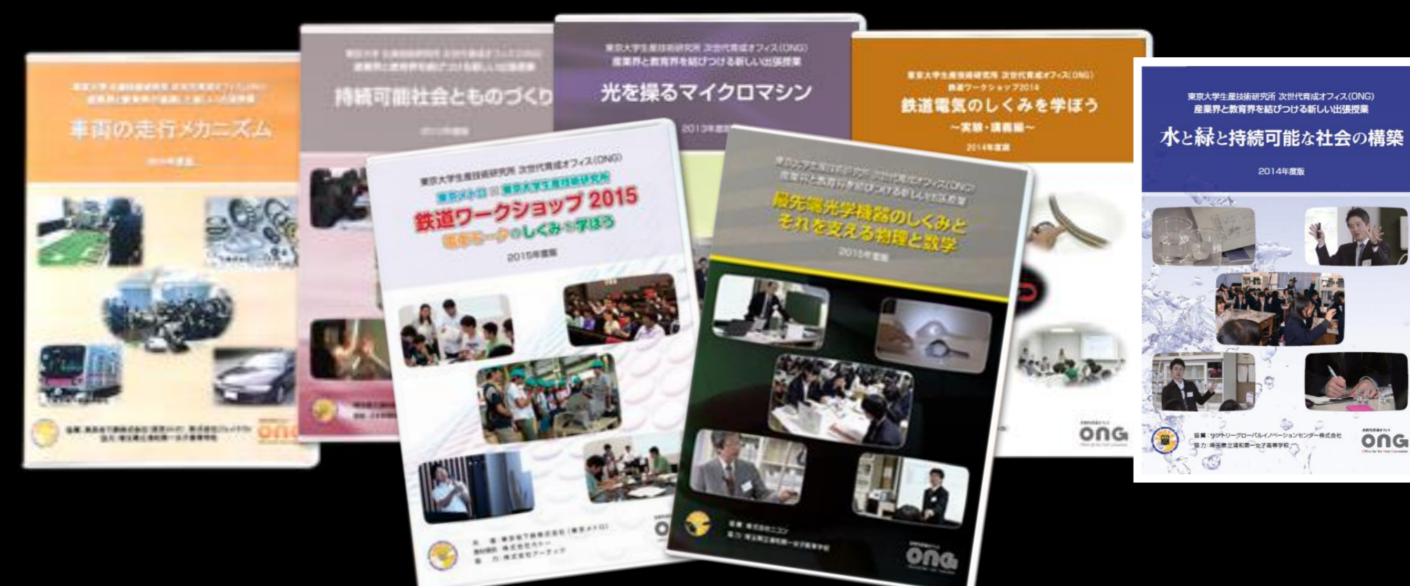
Digital teaching materials