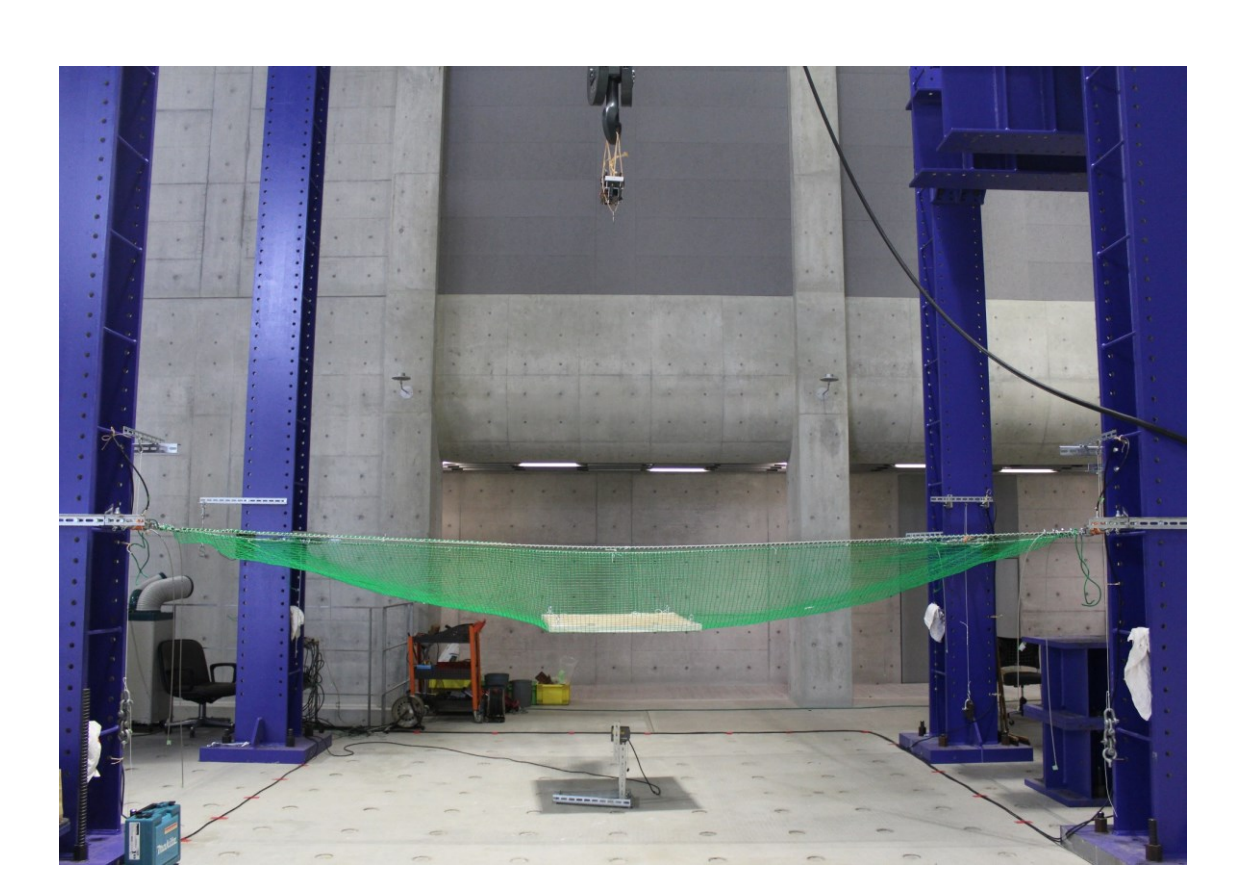
Real-scale tests of the safety net