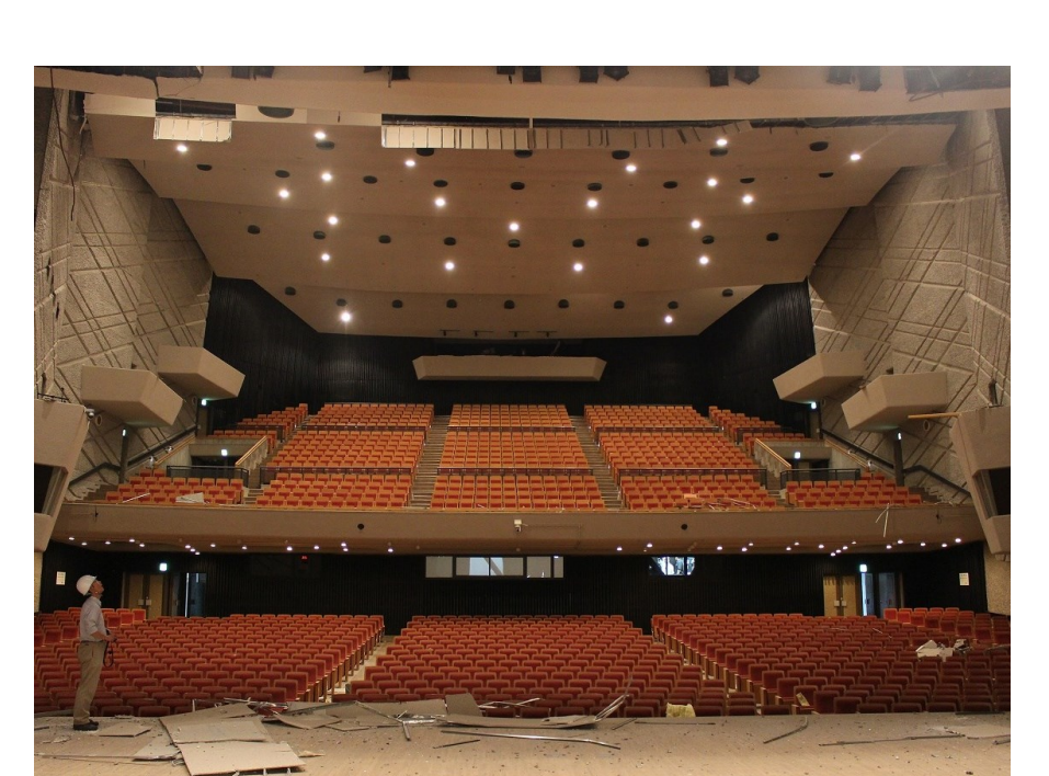
2016 Kumamoto Earthquake