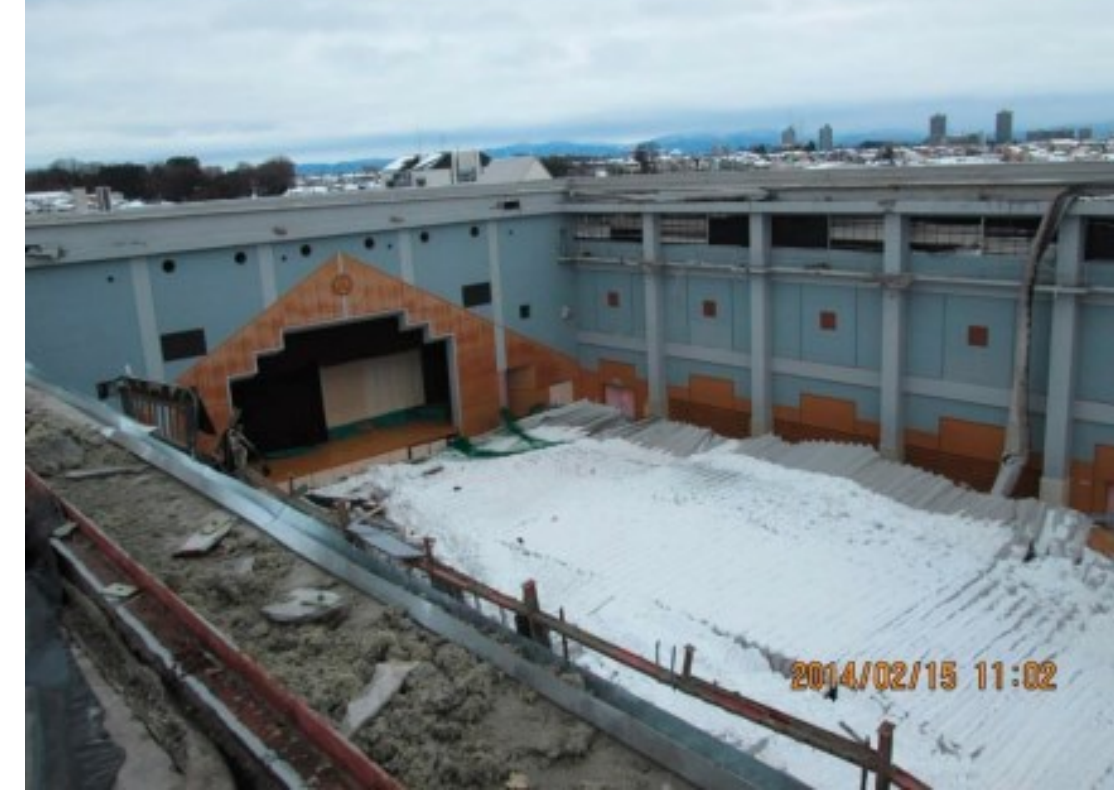
Roof collapse due to the heavy snowfall on Feb. 14, 2014

City of Fujimi http://www.city.fujimi.saitama.jp/40shisei/04gyouseizaisei/shingikai/files/tyousa-siryou4-2.pdf (Apr. 15, 2014)