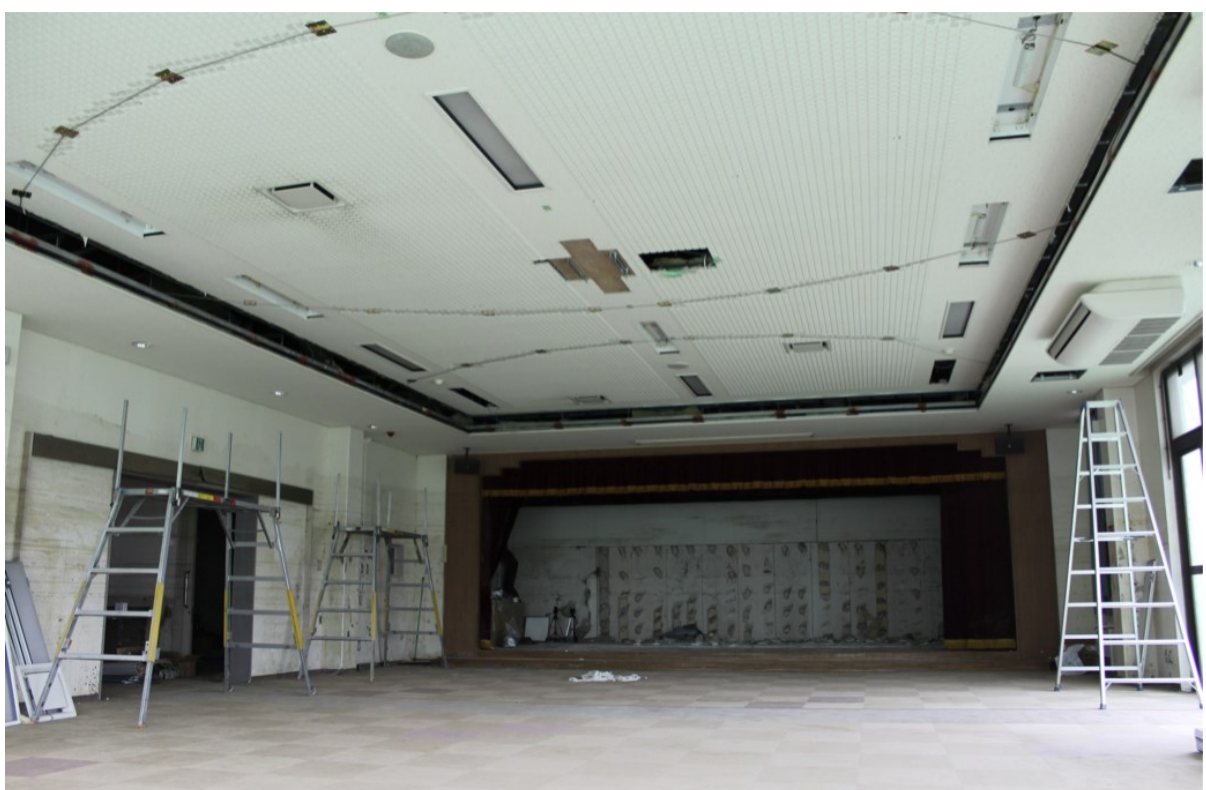
Ceiling reinforcement with cables