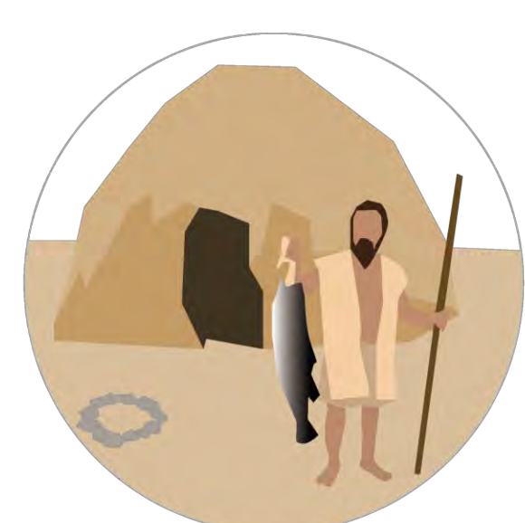
Hunting and gathering

In this exhibition, we will show the characteristics of population movement in the modern to contemporary society and excavate the forgotten knowledge of movement and its positive effect to the global environment and our society. Through that, we aim at providing clues to conceptualize a new form of society on the move in the 21st century.