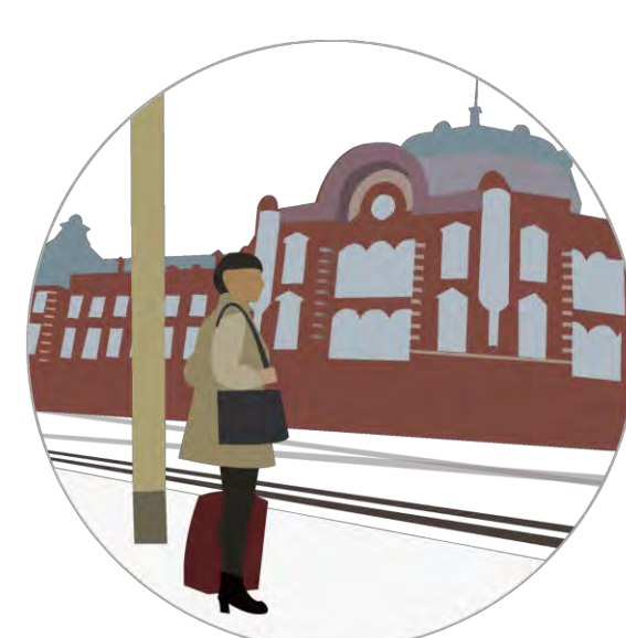
Moving to the capital