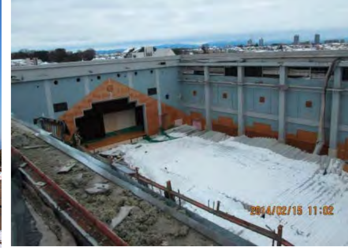
Roof collapse due to the heavy snowfall on Feb. 14, 2014

City of Fujimi http://www.city.fujimi.saitama.jp/40shisei/04gyouseizaisei/shingikai/files/tyousa-siryou4-2.pdf (Apr. 15, 2014)