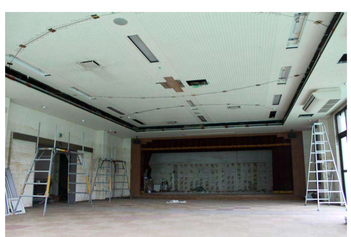
Ceiling reinforcement with cables