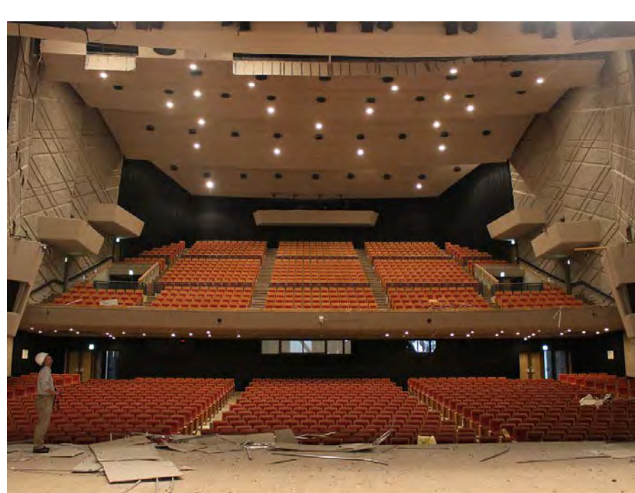
arthquake 2016 Kumamoto Earthquake