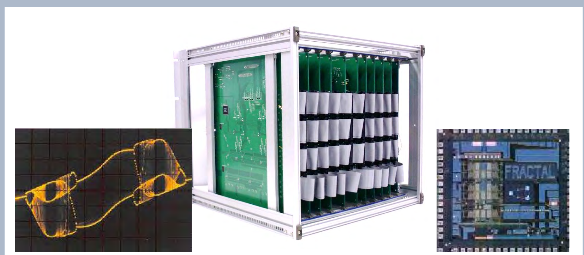
Applications of chaos and fractal: analog silicon neuron and chaotic neuro computer

We are trying to clarify the mechanism of real neural networks and to reveal the high-order functions of the brain through developing mathematical models of neurons/neural networks and identifying underlying non-trivial mathematical structure. As an application, we are also developing analog silicon neural networks and AI in collaboration with Kohno lab.